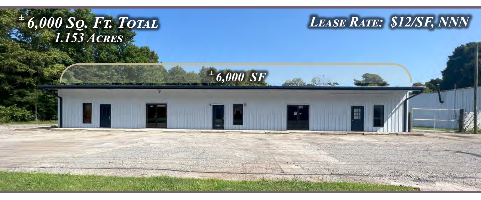
Office/ Warehouse w/ Retail Exposure