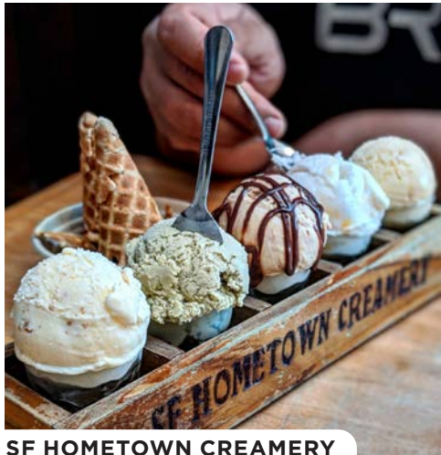
SF HOMETOWN CREAMERY