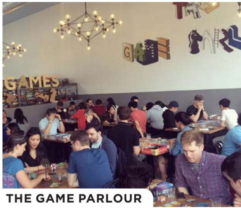
THE GAME PARLOUR