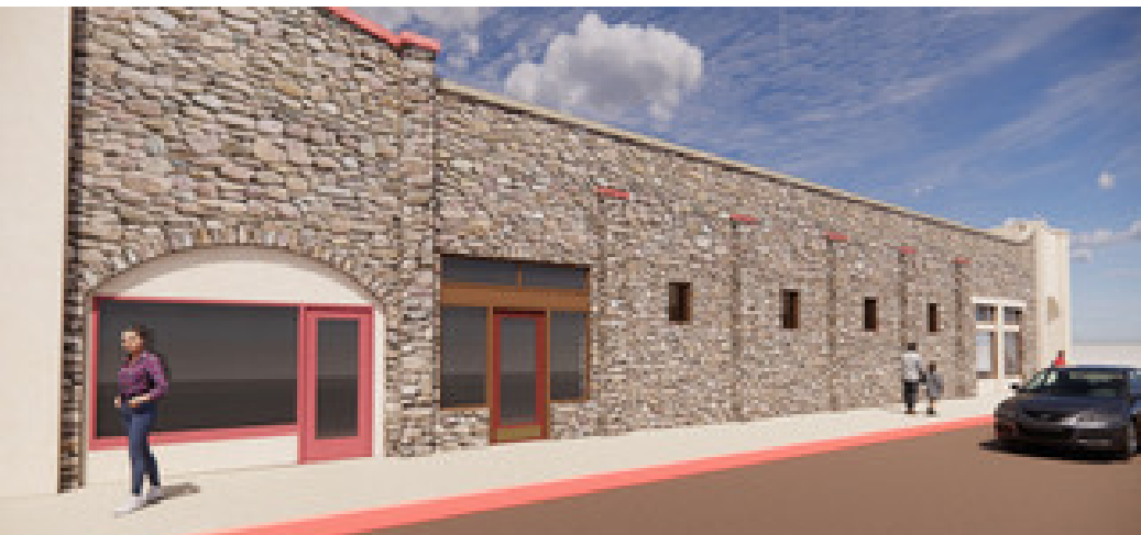
New Entry at 106 Signal Street