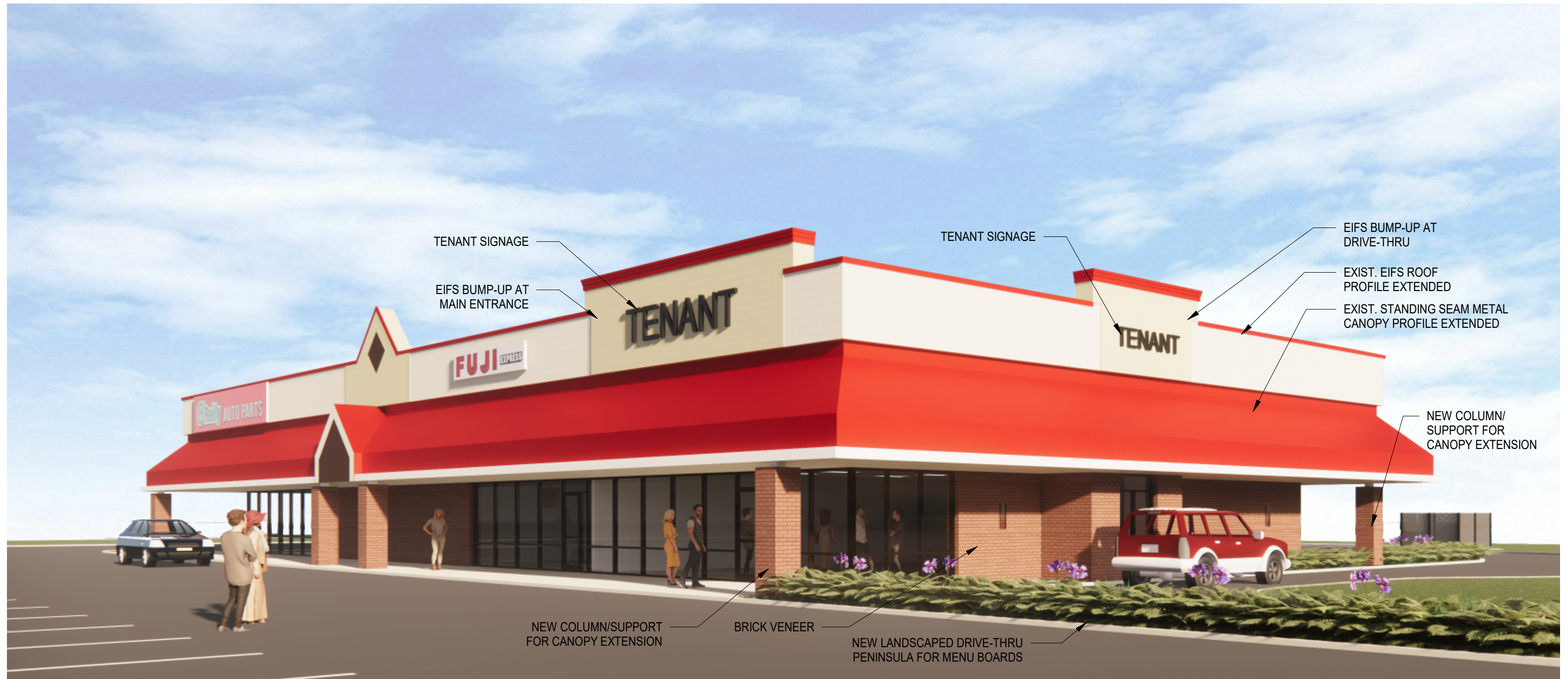
1 DRIVE-THRU VIEW PERSPECTIVE - OPTION 1 NTS