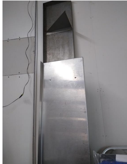
NSF Shelving Units