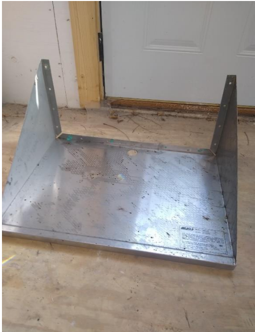
NSF Microwave Shelf