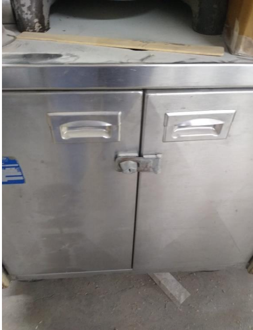
NSF Stainless Storage Cabinet/Table