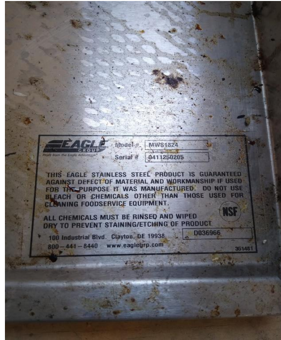
NSF Label Shelving Units, Items to be professionally cleaned