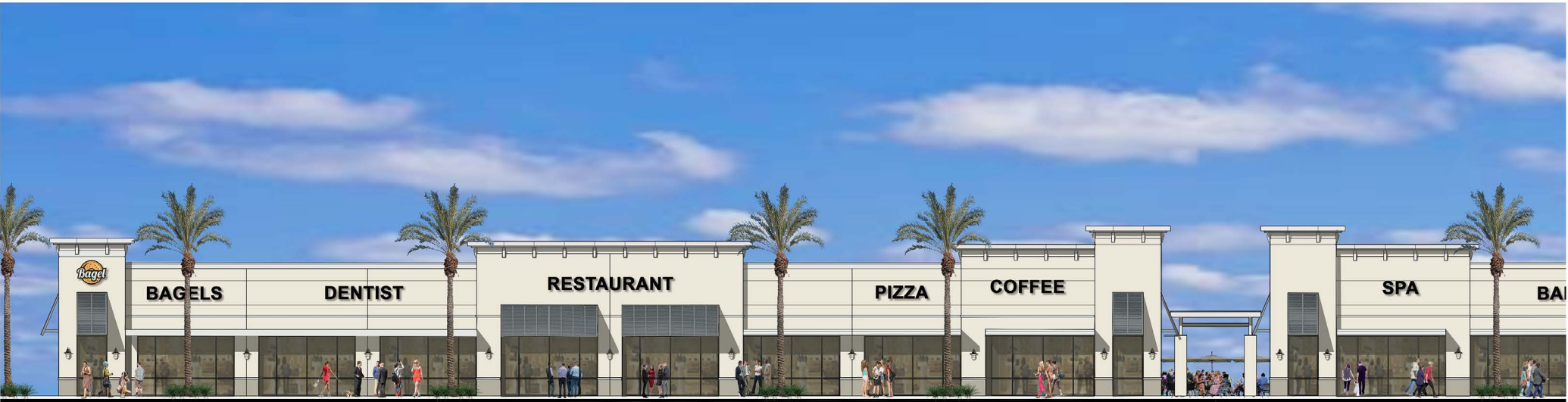
ENLARGED SOUTH ELEVATION