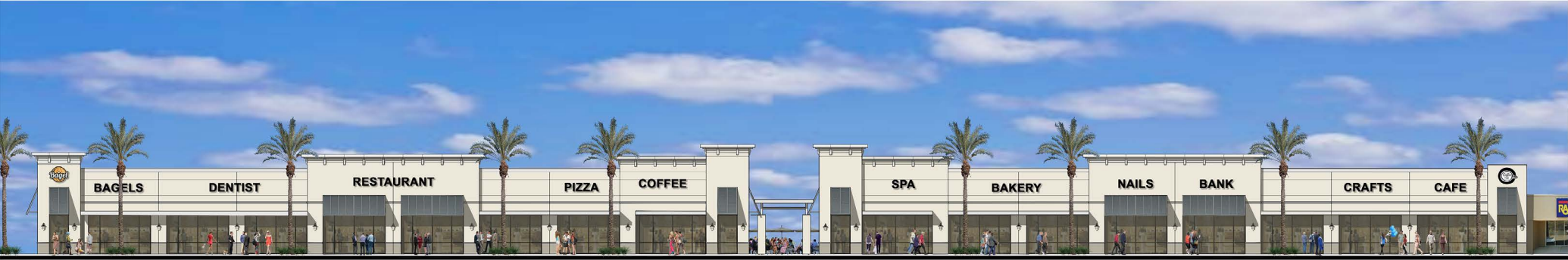
OVERALL SOUTH ELEVATION