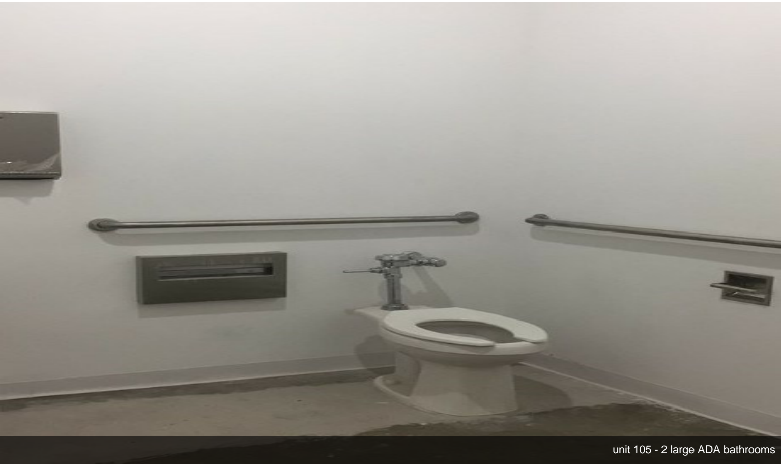
unit 105 - 2 large ADA bathrooms