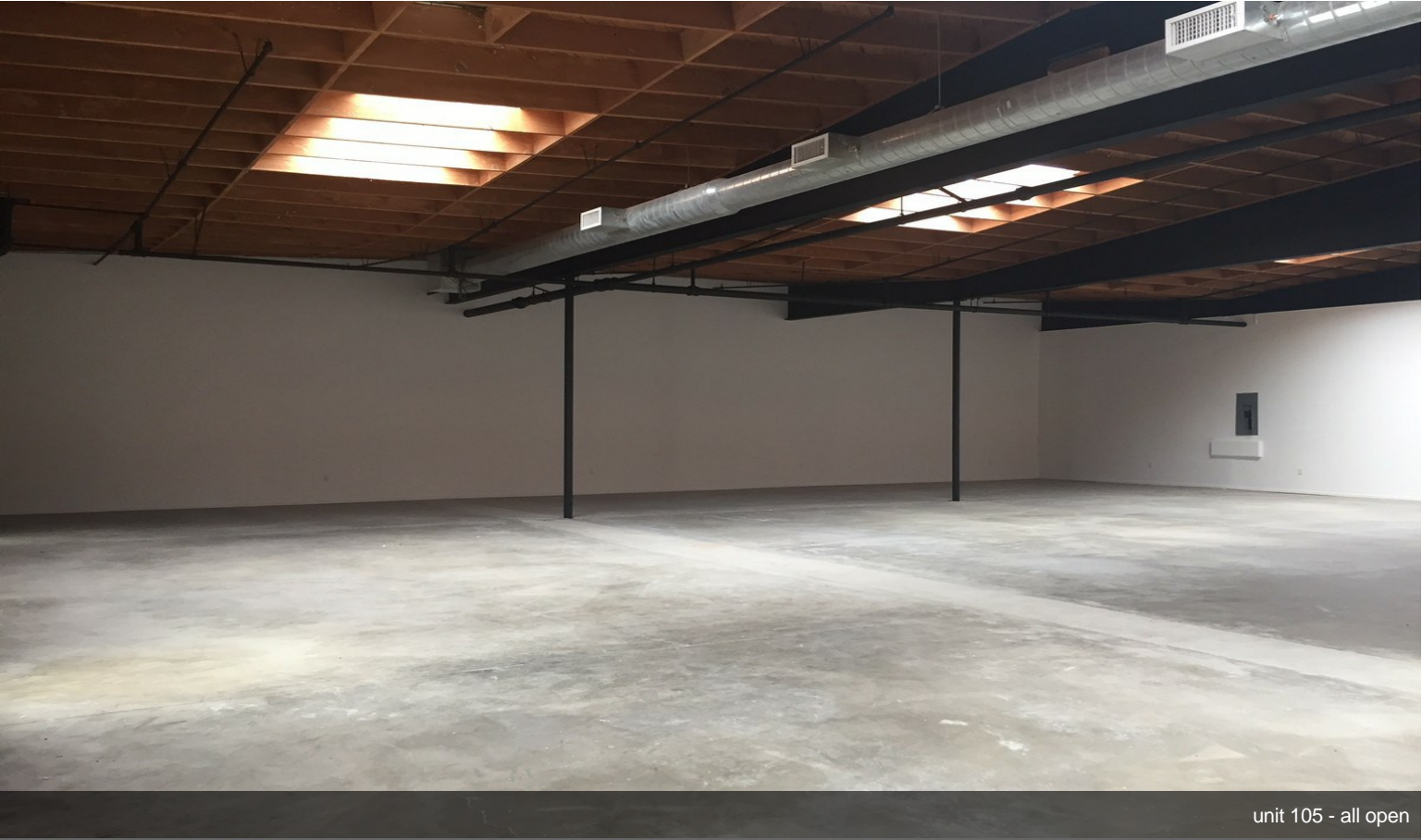
unit 105 - all open