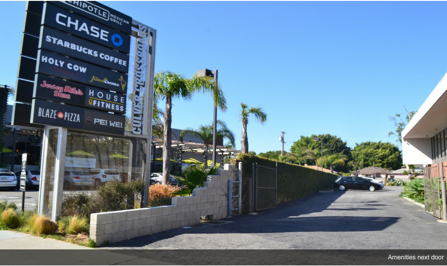
Amenities next door