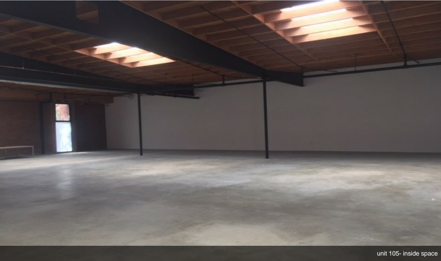
unit 105- inside space