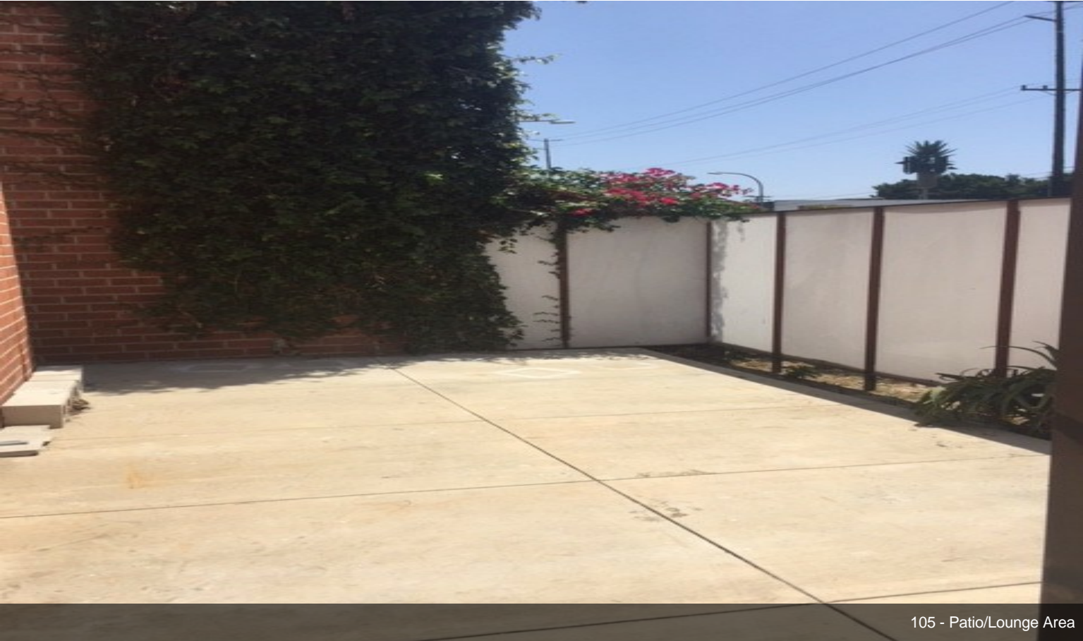
105 - Patio/Lounge Area