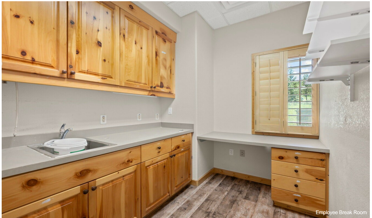
Employee Break Room