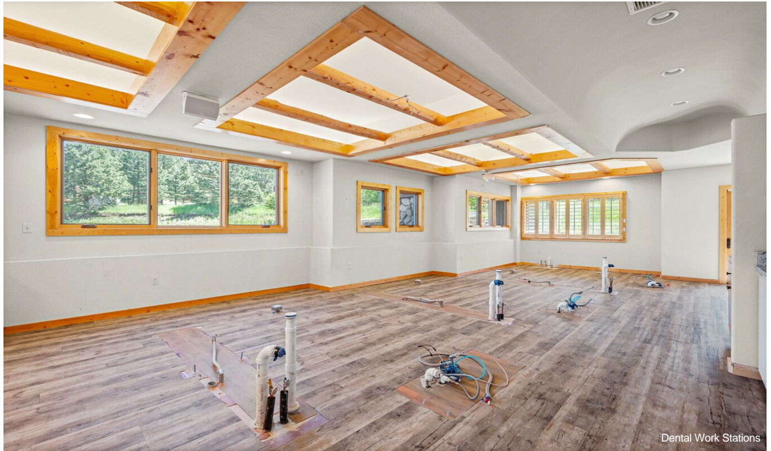
Dental Work Stations