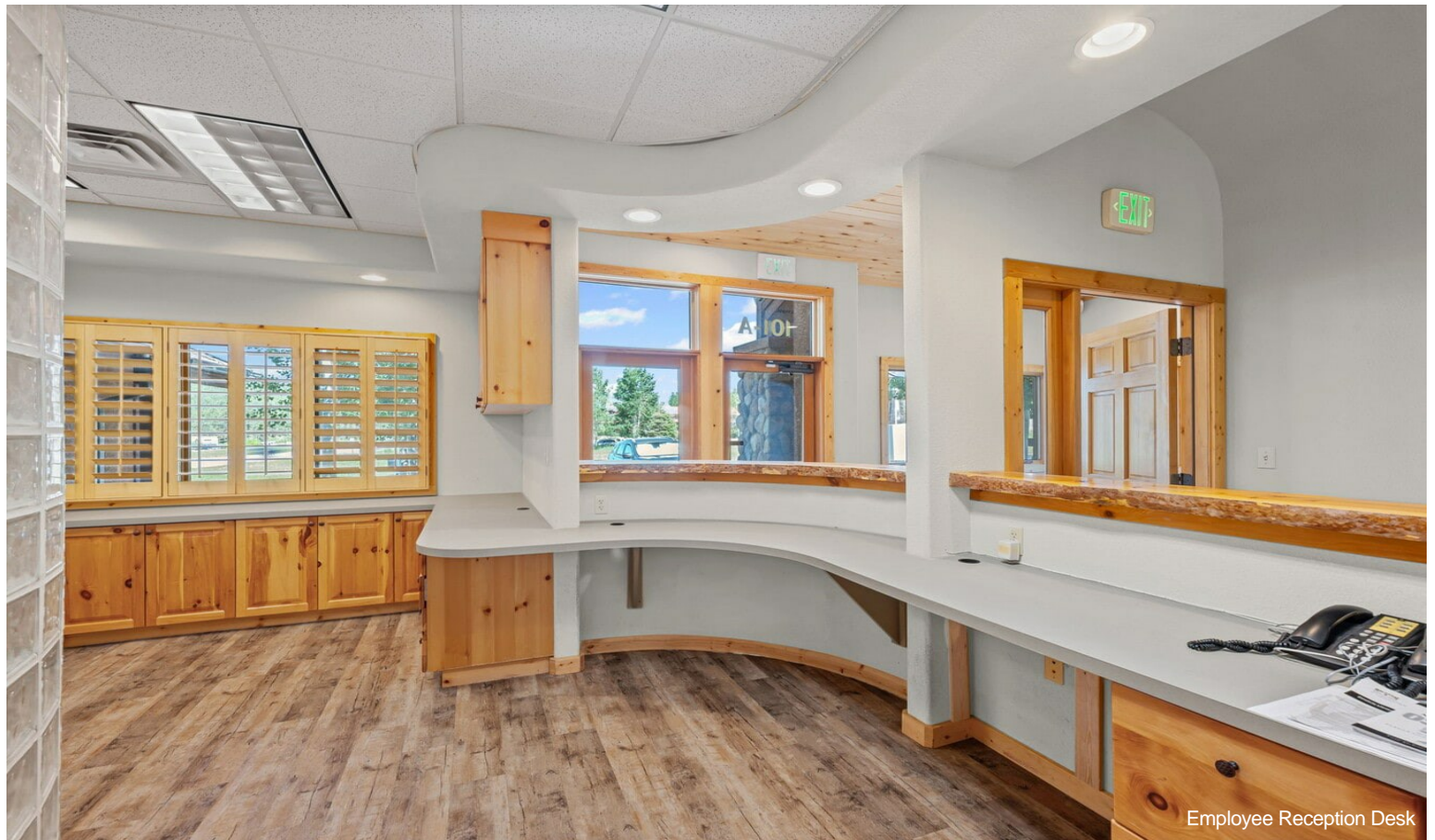
Employee Reception Desk