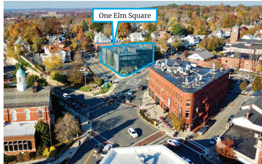
One Elm Square