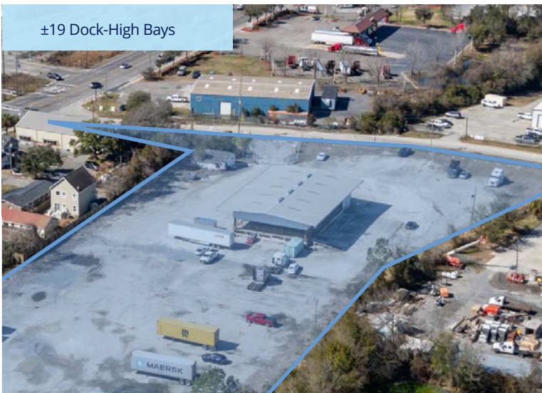
\pm 19 Dock-High Bays