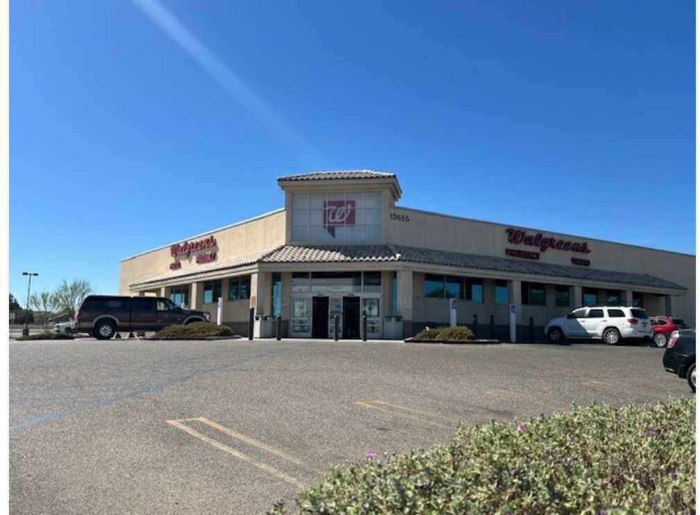
Walgreens drug store