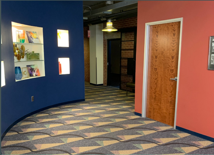
High Quality Finishes Throughout