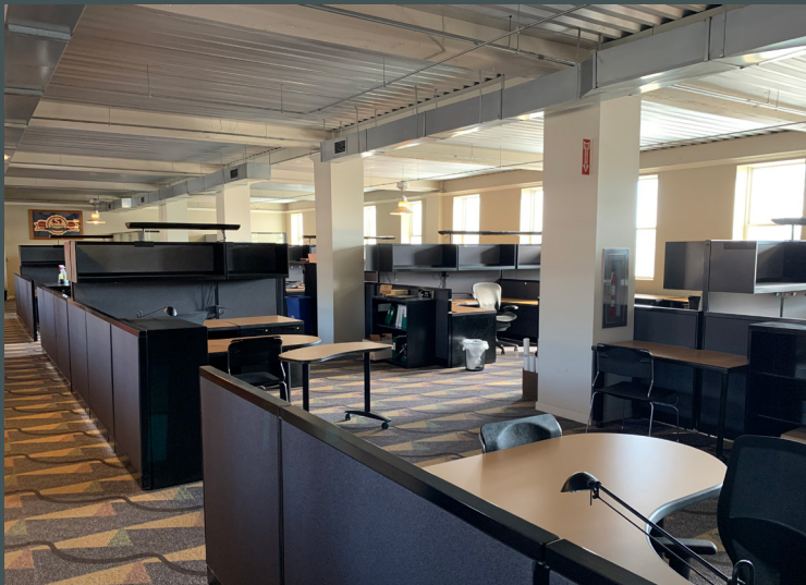
Large Open Work Areas