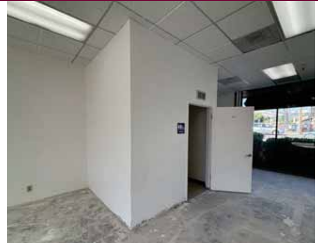
3093 McKee Road - Interior