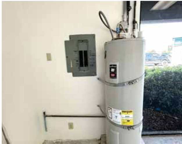
Electrical Panel & 40-Gallon Electric Hot Water Heater