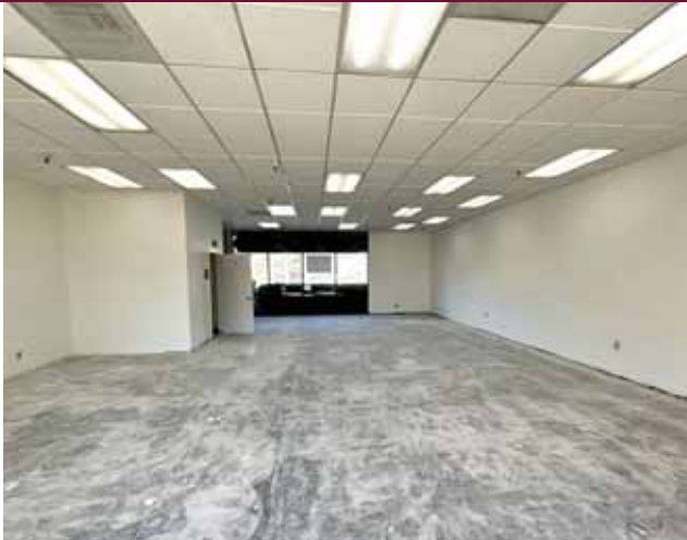
3093 McKee Road - Interior