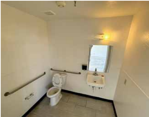
3093 McKee Road - ADA Restroom