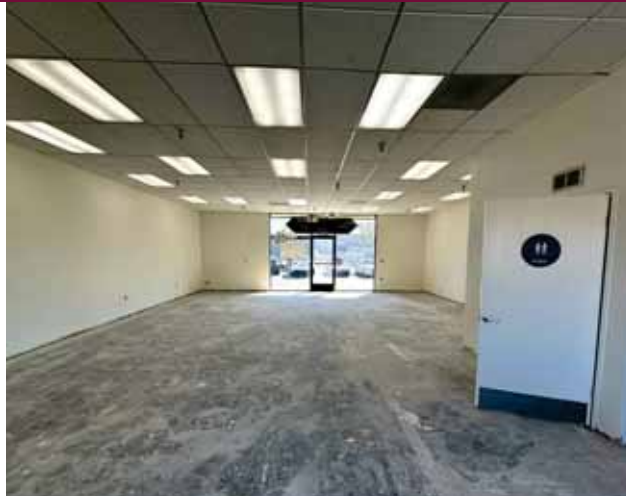
3093 McKee Road - Interior