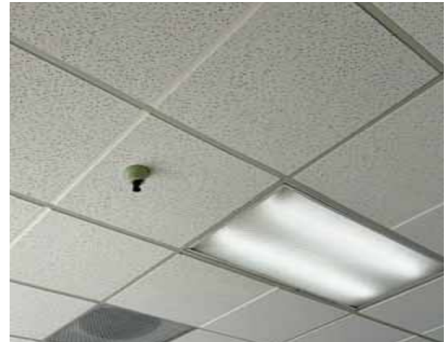
3093 McKee Road - Fire Sprinklered