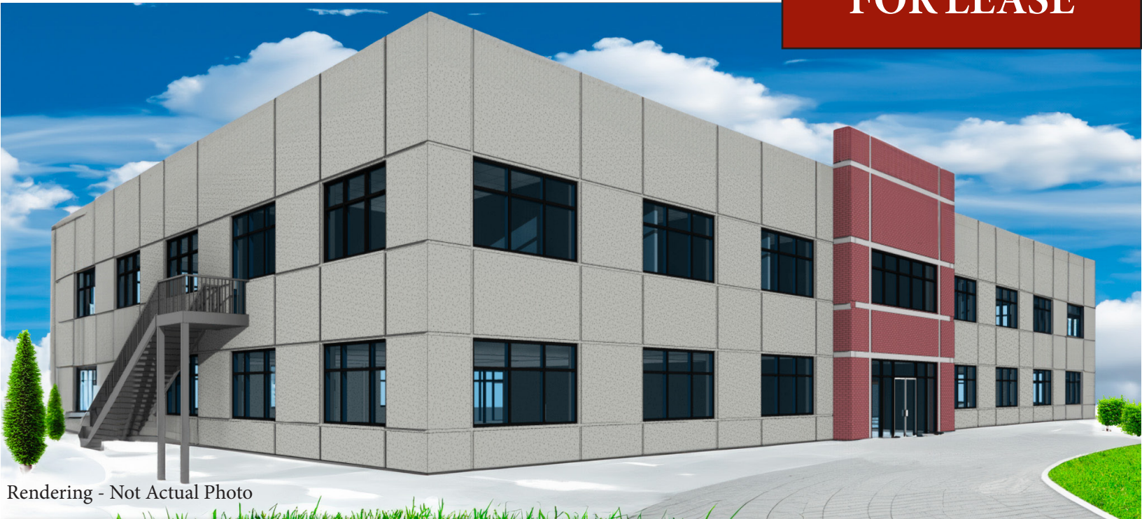
Rendering - Not Actual Photo