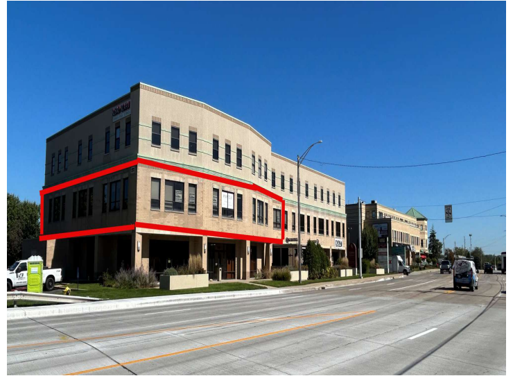
location of office