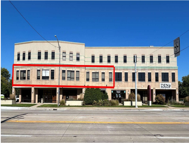
location of office