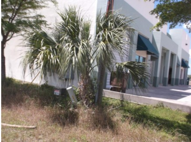
Building Front Photo