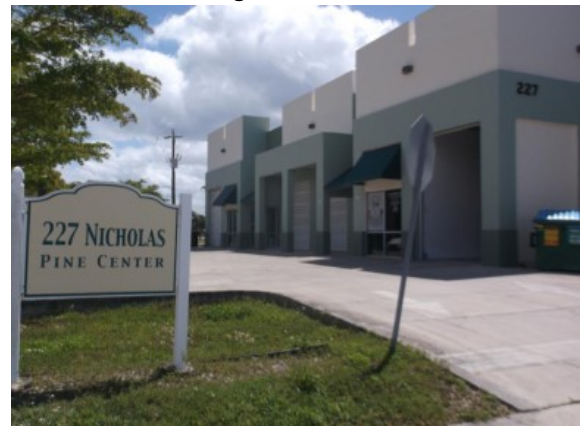
Image of Structure

◀ Photo Date March of 2019 ▶ View other photos