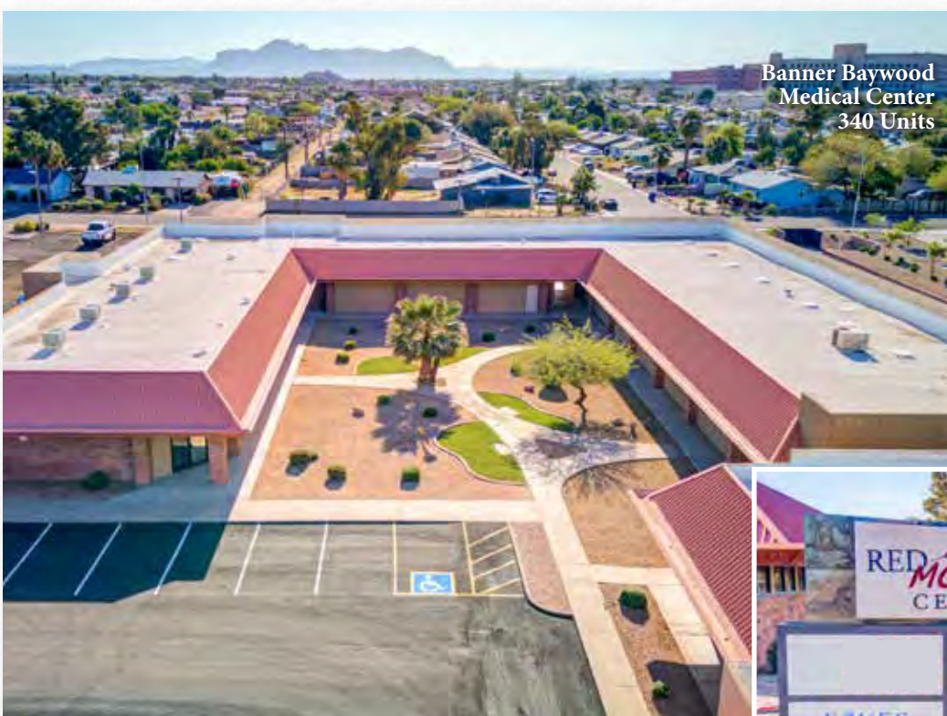
Banner Baywood Medical Center 340 Units