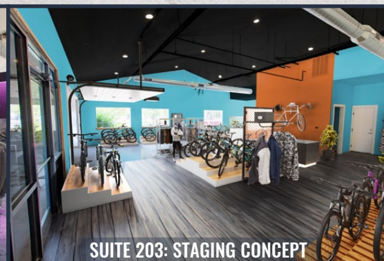
SUITE 203: STAGING CONCEPT