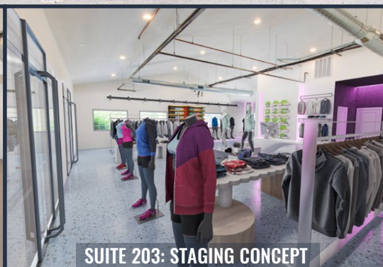
SUITE 203: STAGING CONCEPT