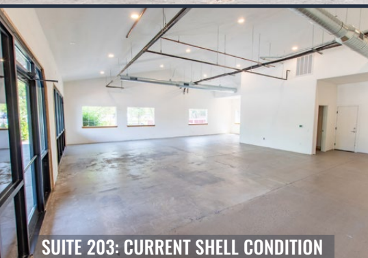
SUITE 203: CURRENT SHELL CONDITION