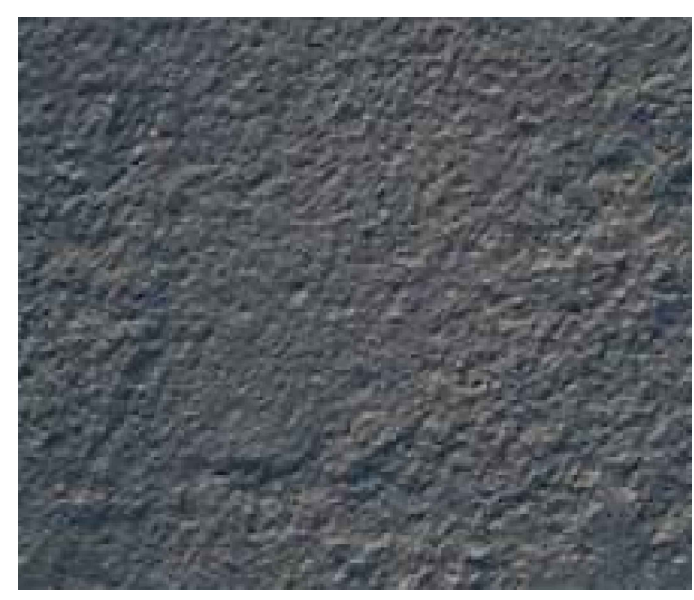
E - MEDIUM STUCCO FINISH - SOFTWARE - SW7074