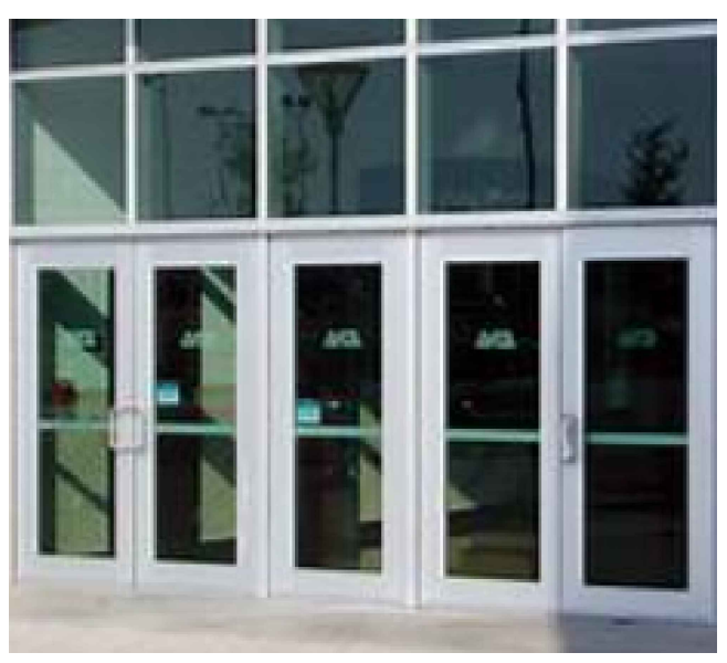
D - IMPACT RESISTANT STOREFRONT SYSTEM-SILVER POWER COAT