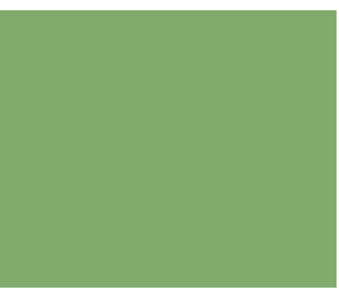
G - MEDIUM TEXTURED FINISH - ORGANIC GREEN SW6732