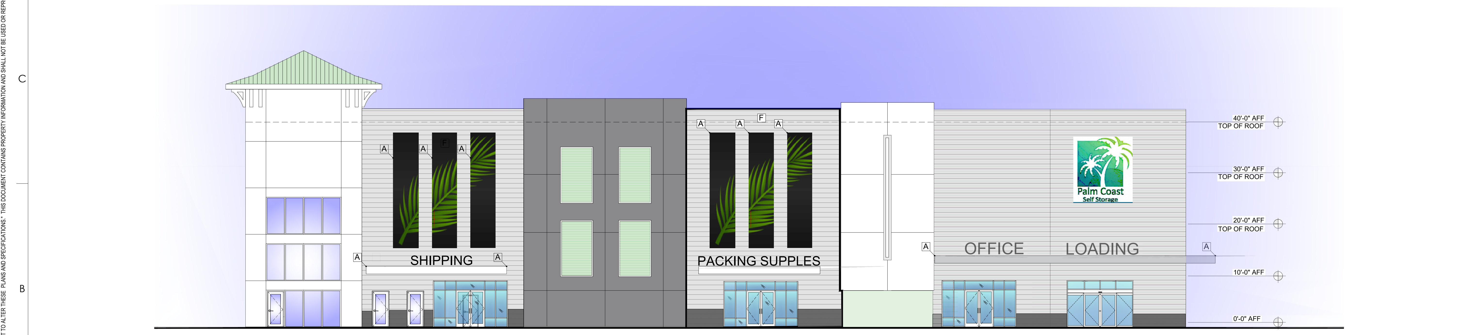
A-2 SOUTH ELEVATION - MARTIN ROAD SE FRONTAGE 1/8" = 1'-0"