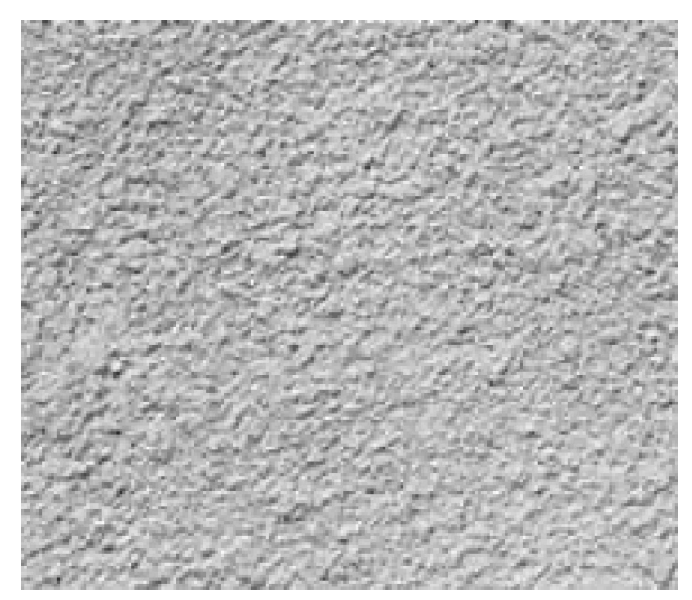
F - MEDIUM STUCCO FINISH - LAZY GRAY SW6253