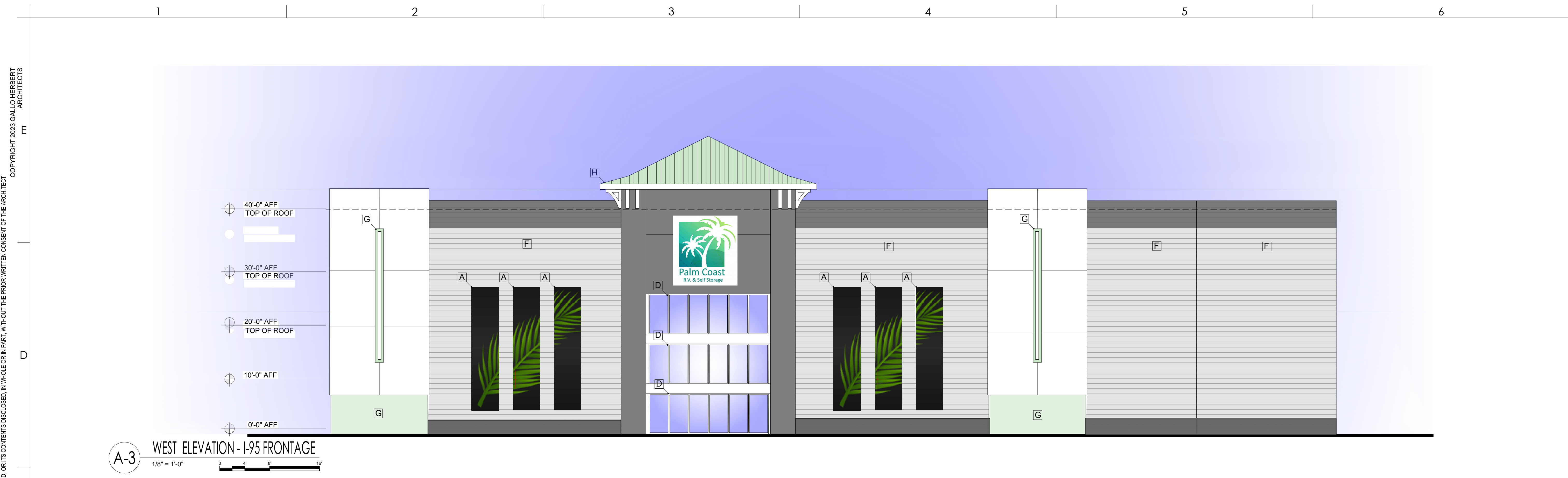
A-3 WEST ELEVATION - I-95 FRONTAGE 1/8" = 1'-0"

IT IS A VIOLATION OF THE LAW FOR ANY PERSON, UNLESS ACTING UNDER THE DIRECTION OF A LICENSED ARCHITECT TO ALTER THESE PLANS AND SPECIFICATIONS. THIS DOCUMENT CONTAINS PROPERTY INFORMATION AND SHALL NOT BE USED OR REPRODUCED, OR ITS CONTENTS DISCLOSED, IN WHOLE OR IN PART, WITHOUT THE PRIOR WRITTEN CONSENT OF THE ARCHITECT