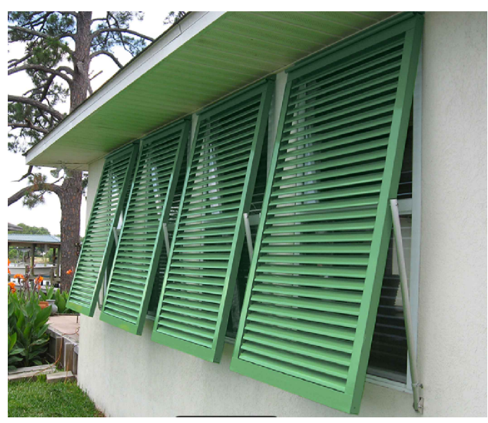
C - BAHAMA SHUTTERS - PALM GREEN - POWDER COAT