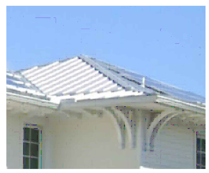
H - STANDING SEAM METAL ROOF - KYNAR - BRIGHT SILVER