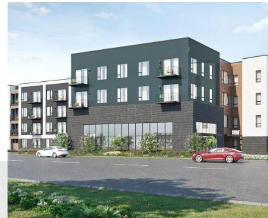
Lyv at Uptown & Main | Rooftop Rendering