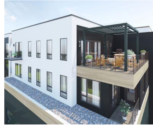
Lyv at Uptown & Main | Exterior Rendering