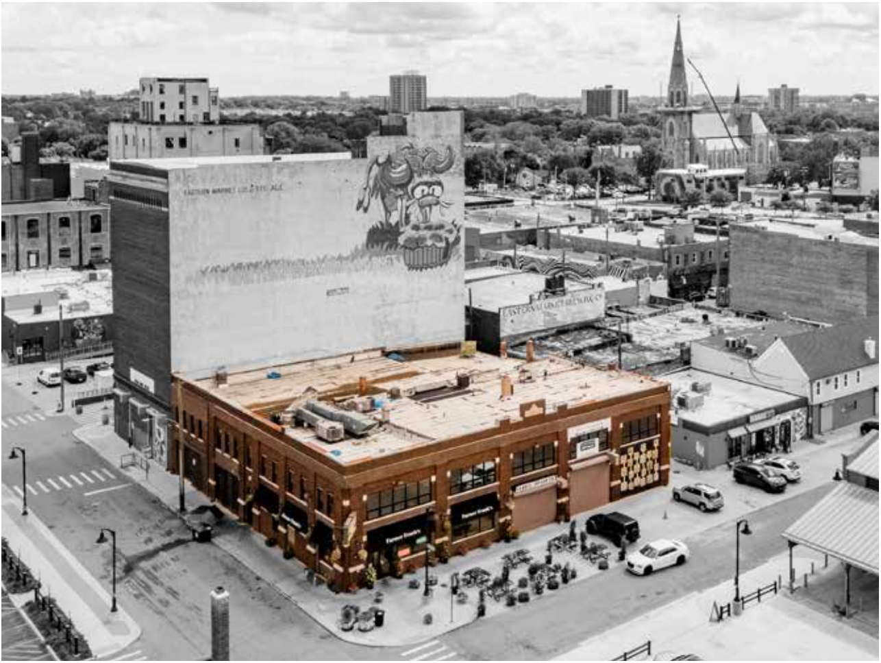
[CLOCKWISE FROM ABOVE] STREET VIEW, PATIO, AND PARCEL OUTLINE