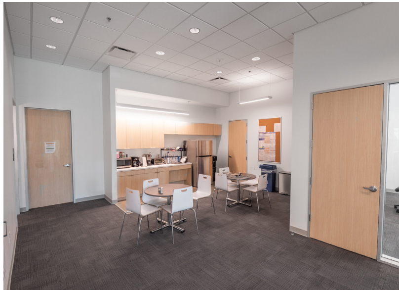
Clockwise from top left: Warehouse space, open office, conference room, break room