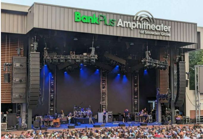
BankPlus Amphitheater (0.5 Miles)