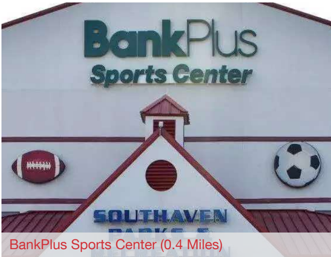
BankPlus Sports Center (0.4 Miles)