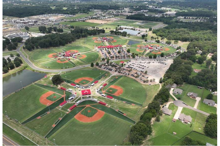
Snowden Grove Park (0.5 Miles)