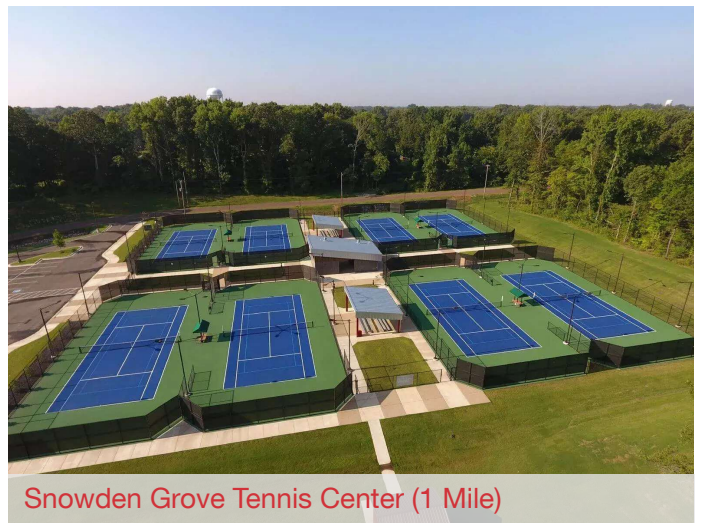
Snowden Grove Tennis Center (1 Mile)