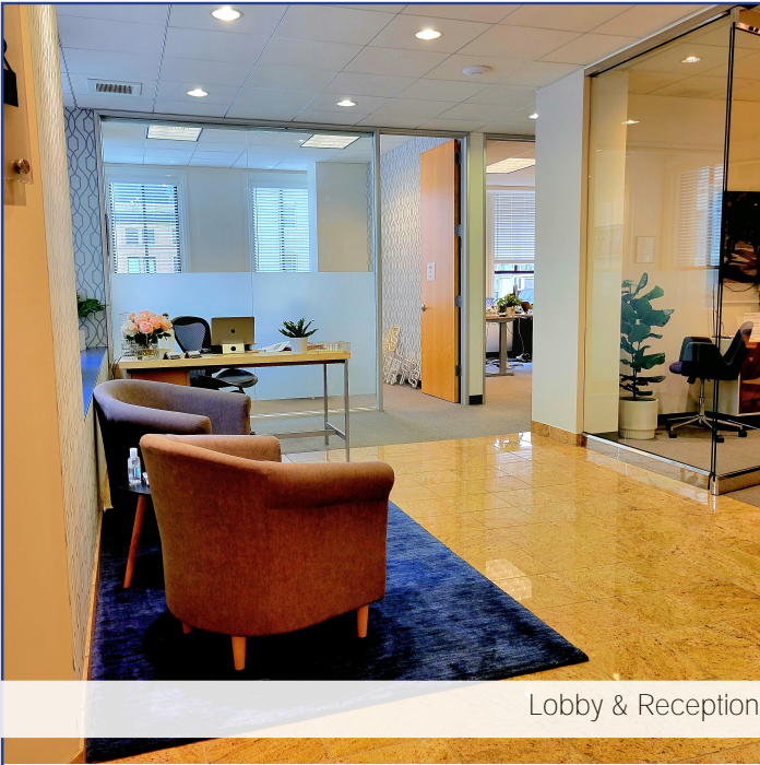
Lobby & Reception