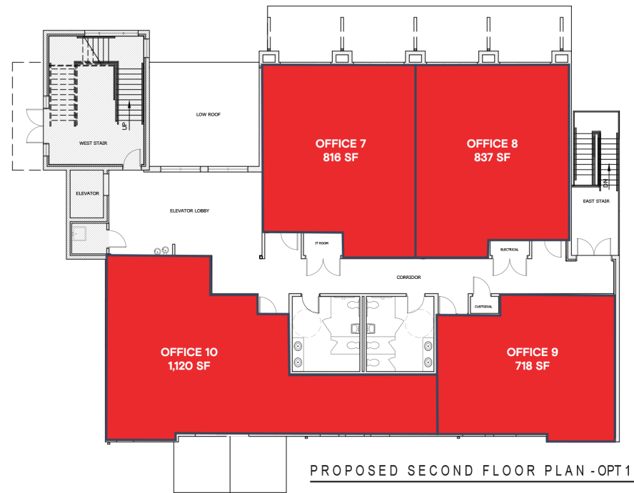
PROPOSED SECOND FLOOR PLAN -OPT 1