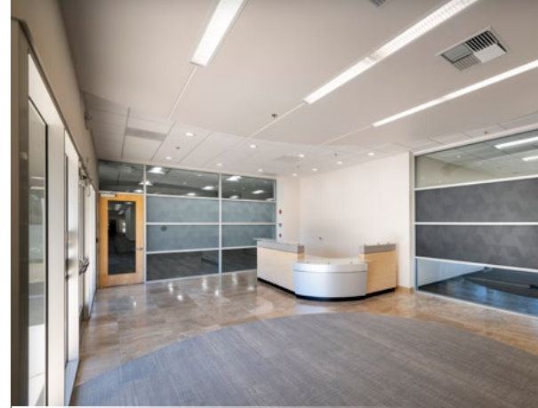
Lobby Suite A