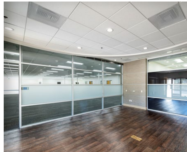
Lobby Suite B