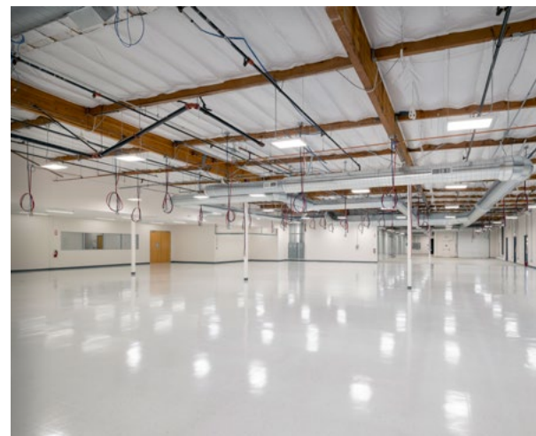
R&D / Lab / Mfg