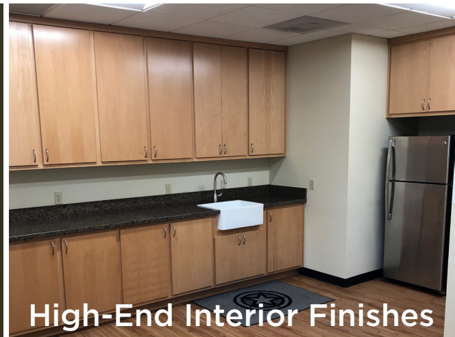
High-End Interior Finishes