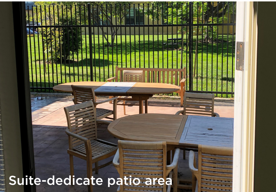
Suite-dedicate patio area

18 Business Pkwy, Sacramento CA ±3,714 SF office space available