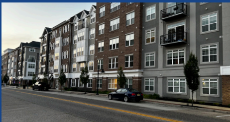
225 HADDON AVENUE