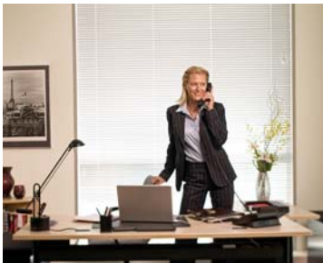
Fully equipped offices On-Demand.