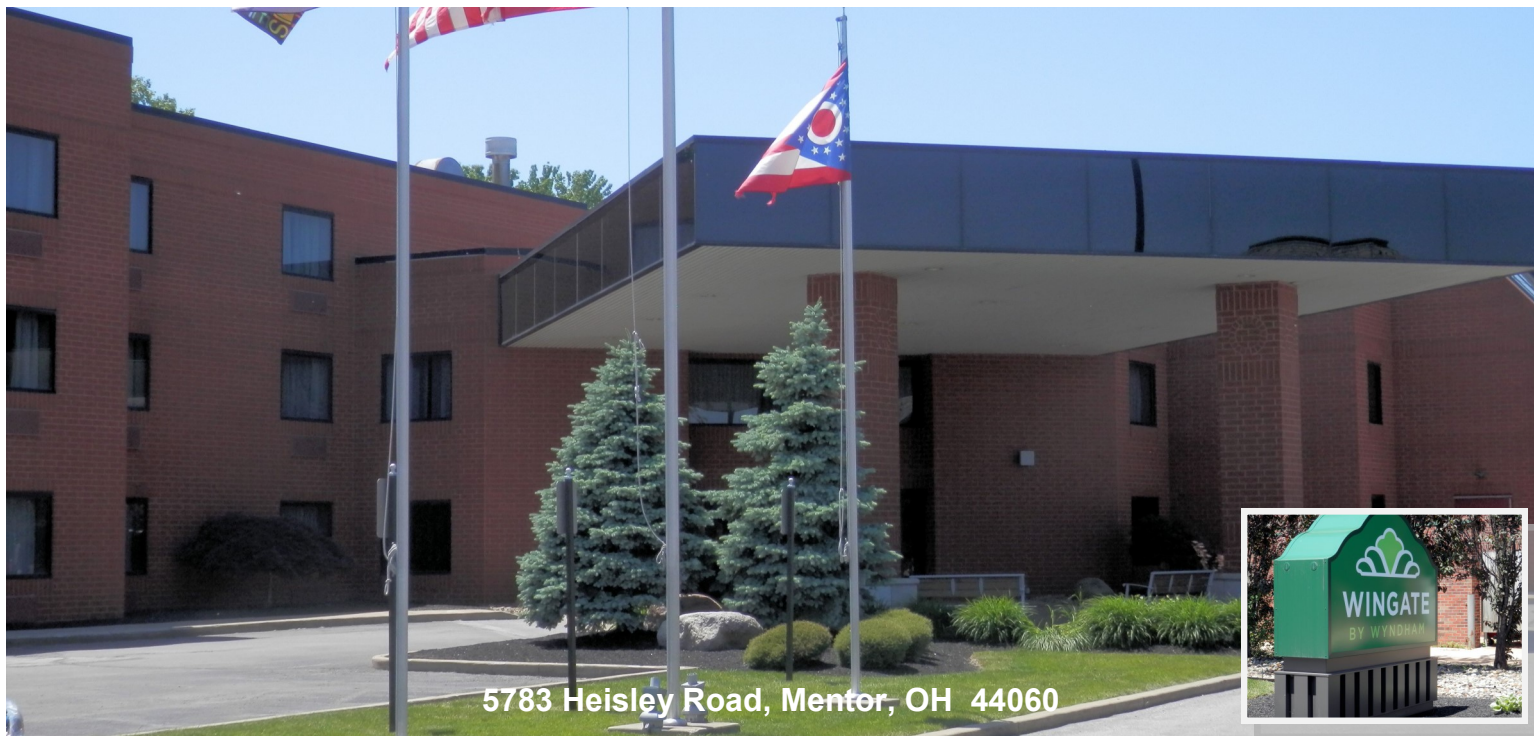
5783 Heisley Road, Mentor, OH 44060