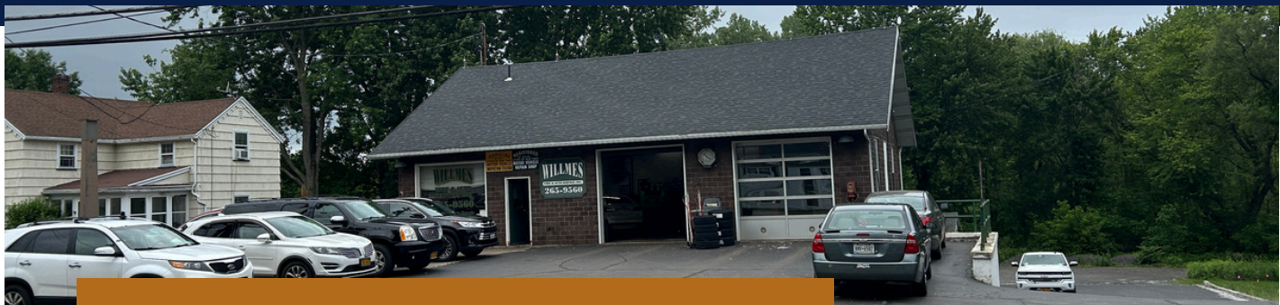
3,464 SF Auto Repair Facility