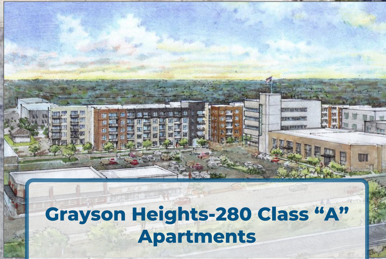
Grayson Heights-280 Class "A" Apartments