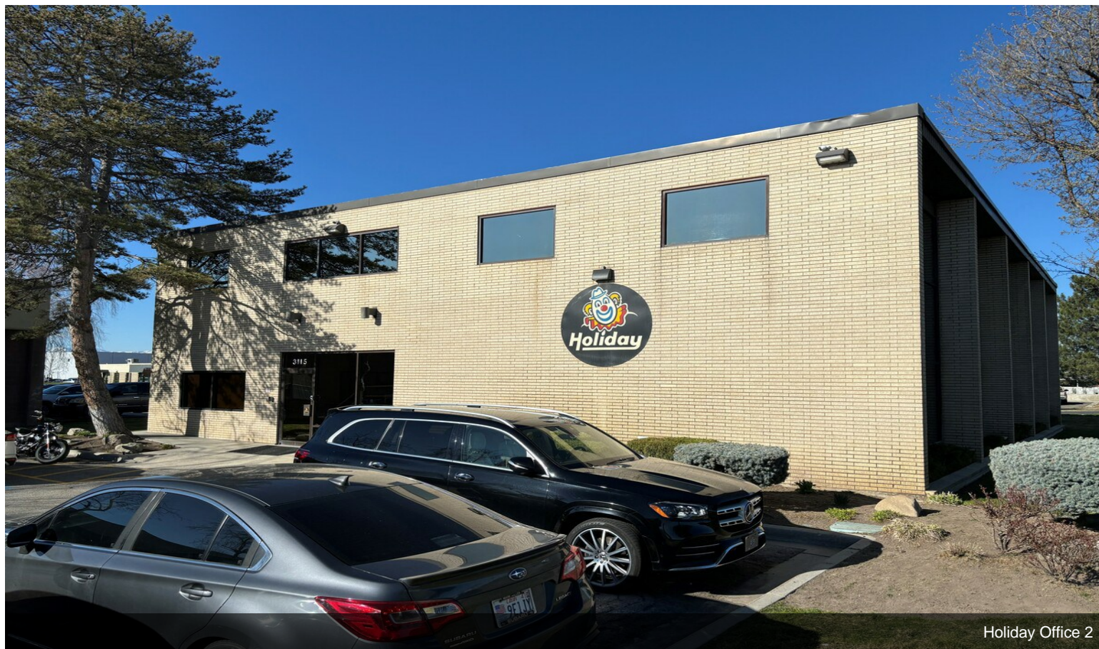
Holiday Office 2