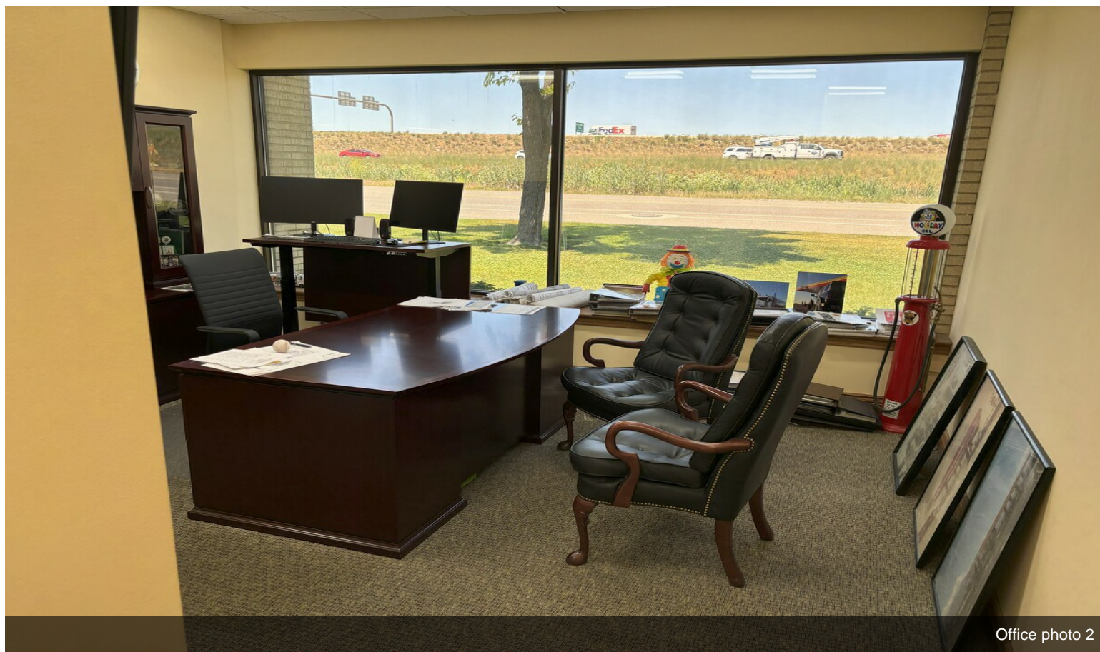
Office photo 2