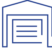
2 Dock High Positions