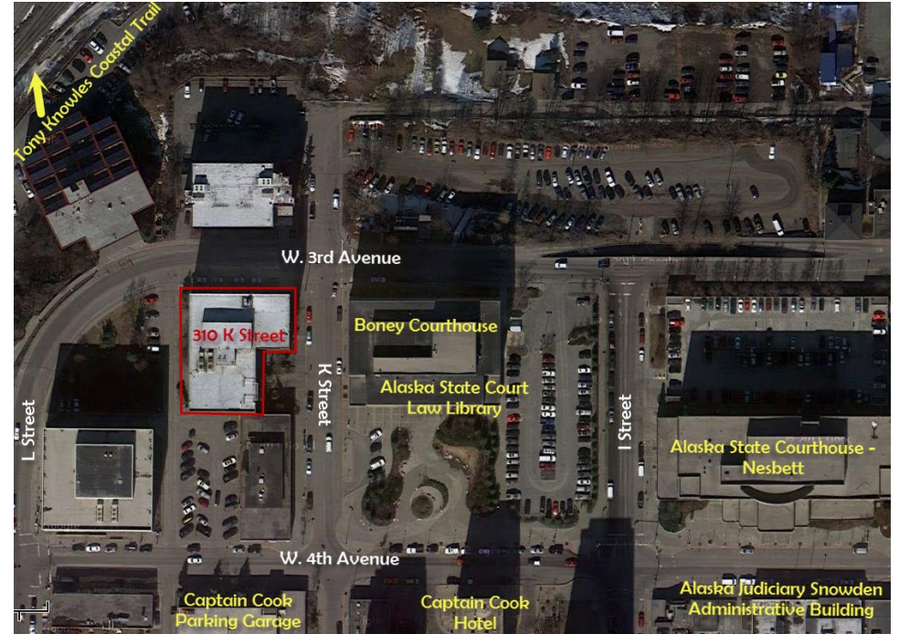
310 K Street 4th floor