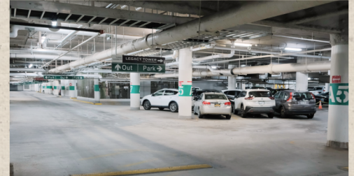
SAFE, CONVENIENT PARKING