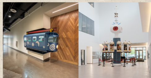
TWO LOCAL LANDMARKS