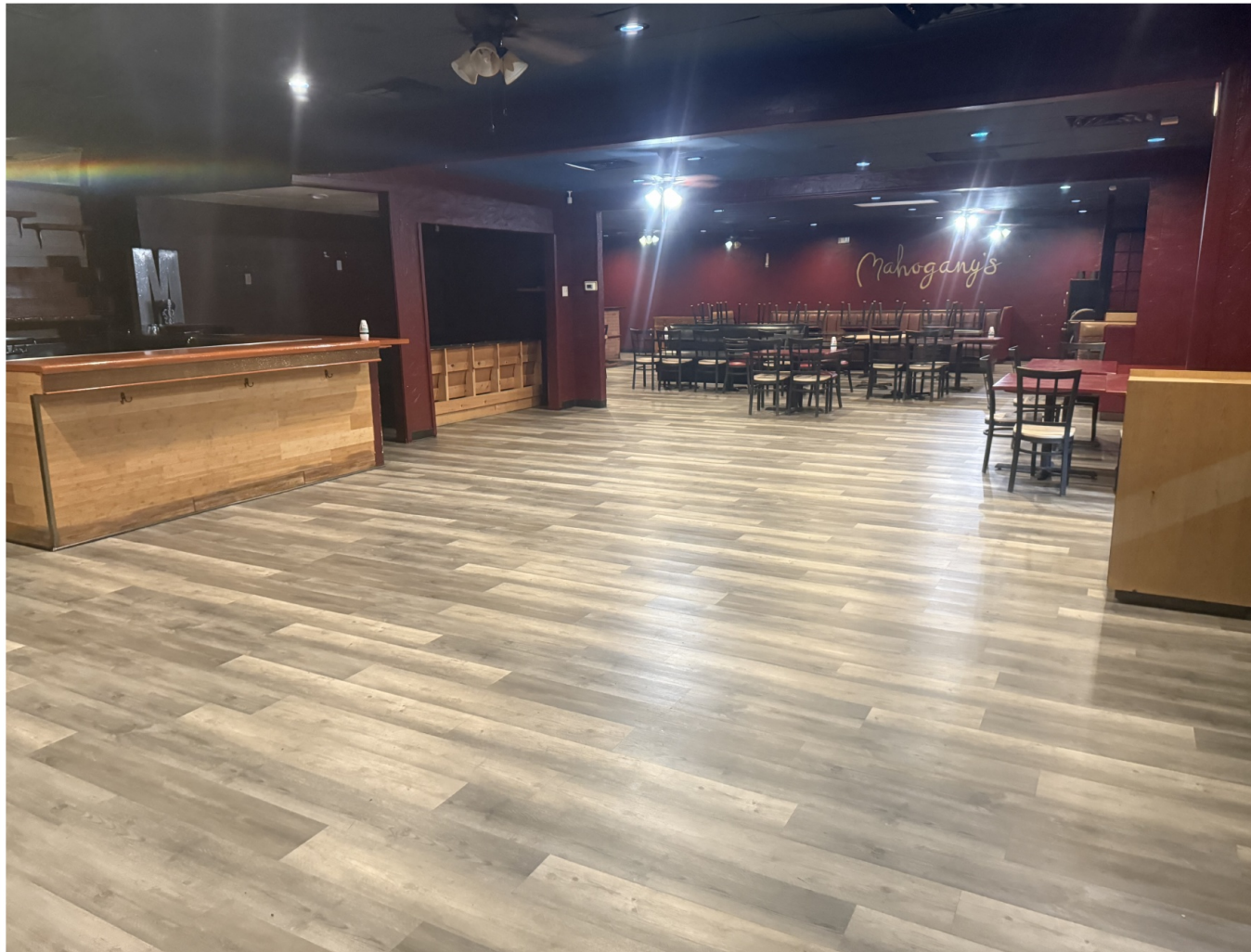
Suite 120 — 3,990 SF | 2nd Gen Restaurant Space

INTERIOR PHOTOS — Suite 120 | 3,990 SF | Turnkey Restaurant (1 of 6)