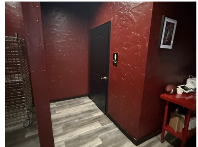
Suite 120 — Interior