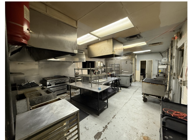
Suite 120 — Interior