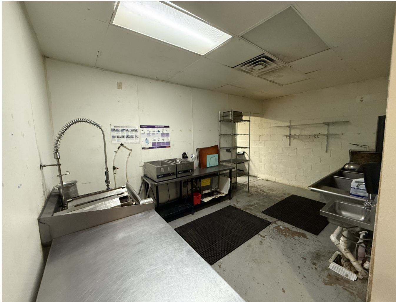
Suite 120 — 3,990 SF | 2nd Gen Restaurant Space

INTERIOR PHOTOS — Suite 120 | 3,990 SF | Turnkey Restaurant (3 of 6)