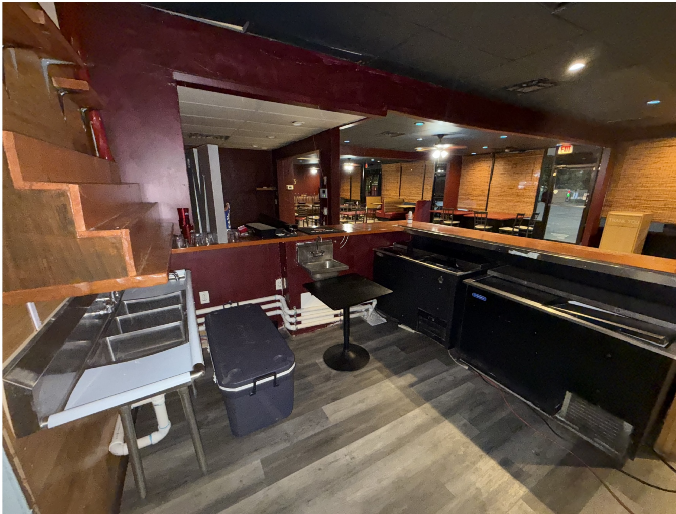
Suite 120 — 3,990 SF | 2nd Gen Restaurant Space

INTERIOR PHOTOS — Suite 120 | 3,990 SF | Turnkey Restaurant (6 of 6)