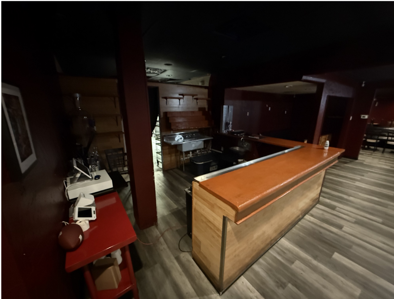
Suite 120 — 3,990 SF | 2nd Gen Restaurant Space

INTERIOR PHOTOS — Suite 120 | 3,990 SF | Turnkey Restaurant (5 of 6)