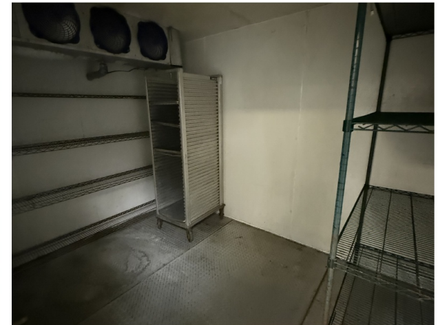
Suite 120 — Interior