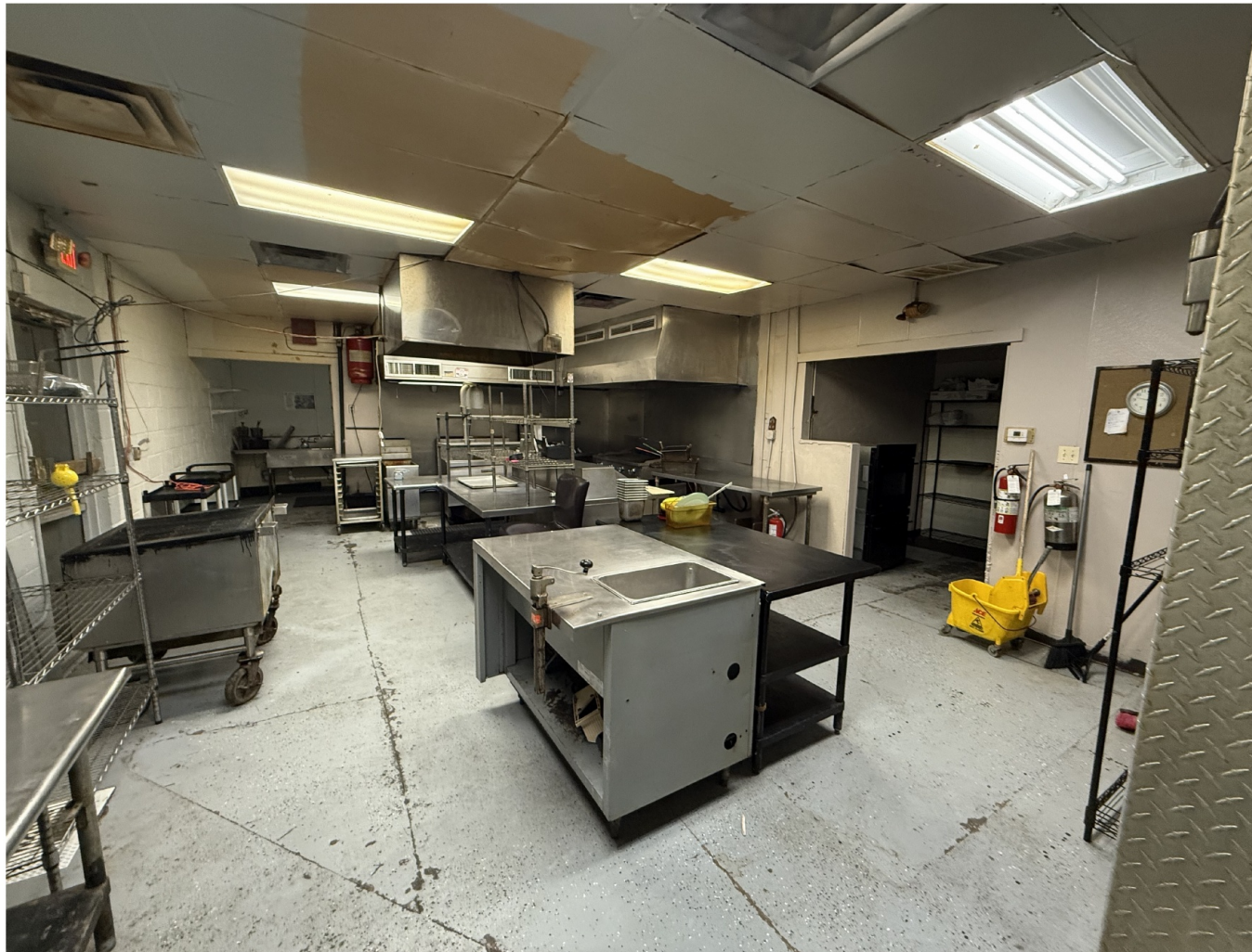
Suite 120 — 3,990 SF | 2nd Gen Restaurant Space

INTERIOR PHOTOS — Suite 120 | 3,990 SF | Turnkey Restaurant (4 of 6)