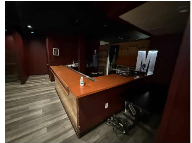
Suite 120 — Interior