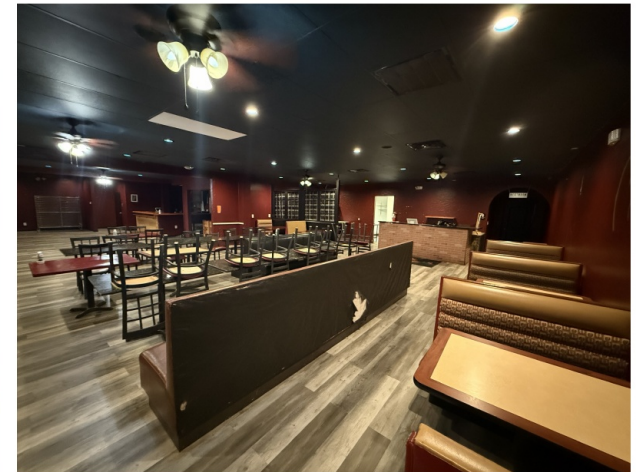
Suite 120 — Interior