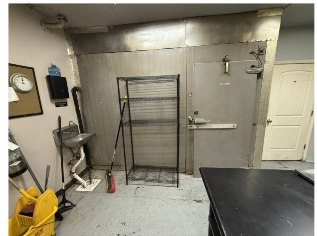
Suite 120 — Interior