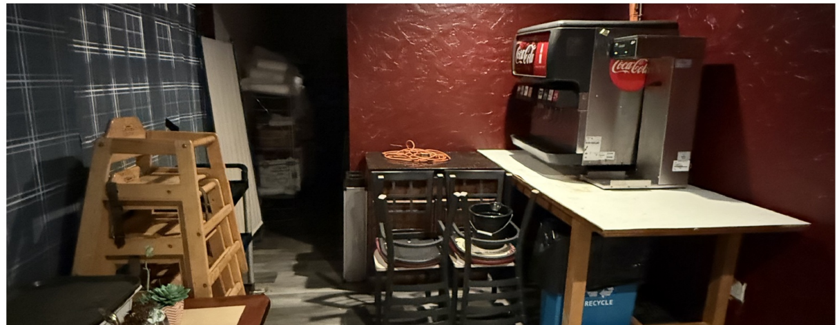
Suite 120 — Interior