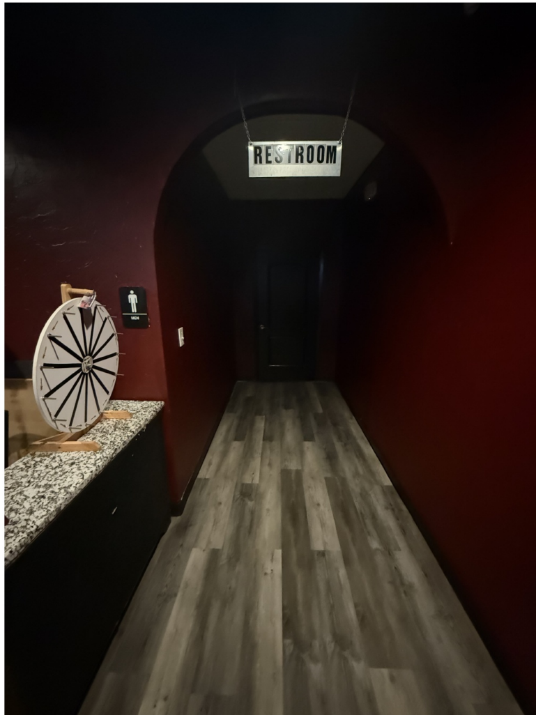
Suite 120 — 3,990 SF | 2nd Gen Restaurant Space

INTERIOR PHOTOS — Suite 120 | 3,990 SF | Turnkey Restaurant (2 of 6)