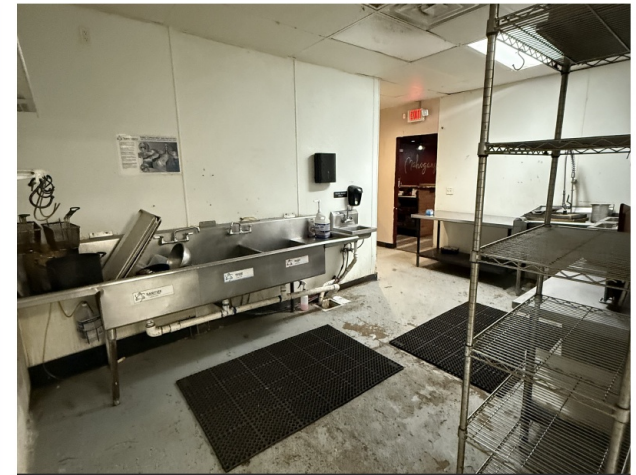
Suite 120 — Interior