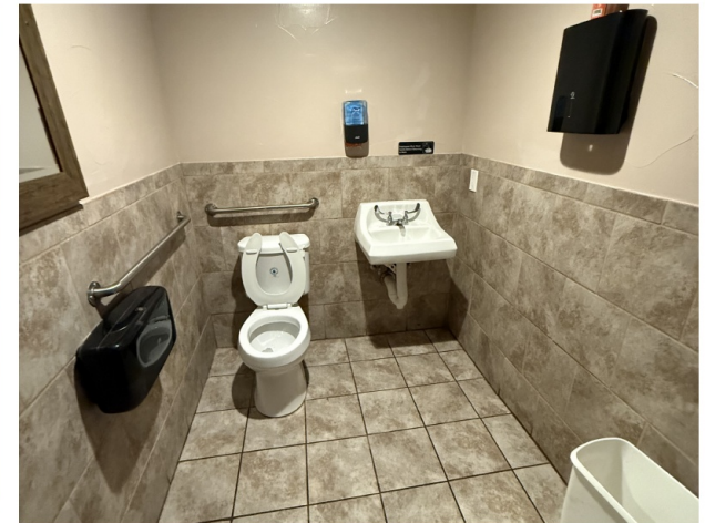
Suite 120 — Interior