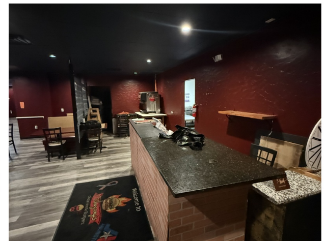
Suite 120 — Interior