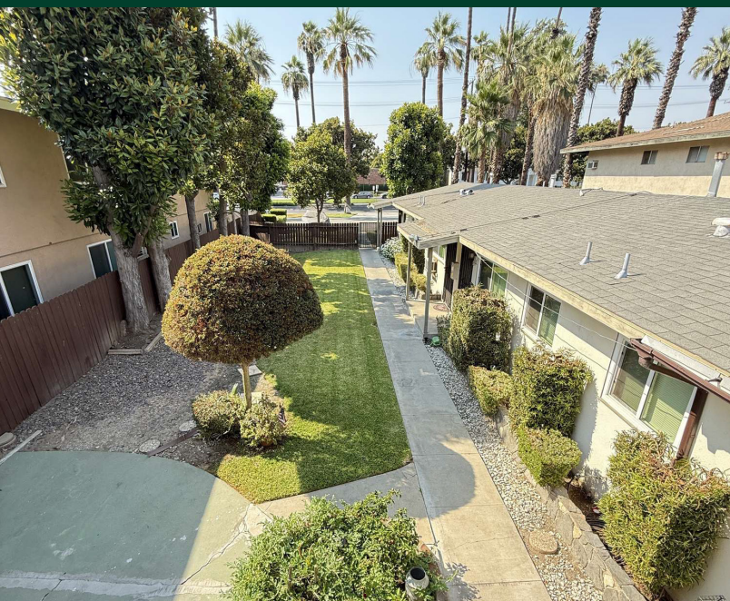
7428-7438 Magnolia Ave