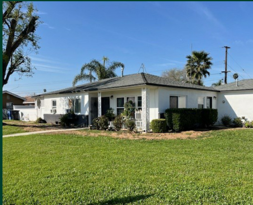
5608 Ivanhoe - Single family