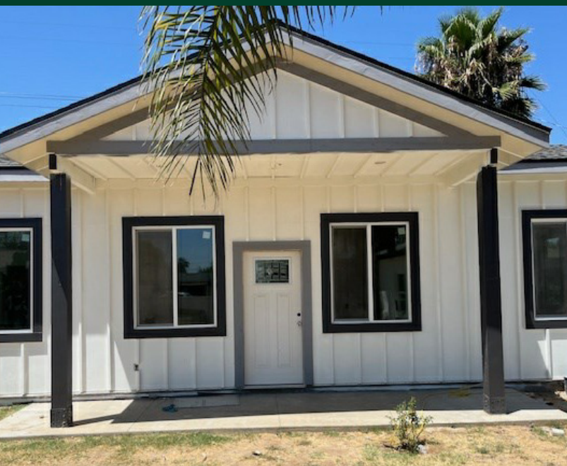
5606 Ivanhoe - New ADU