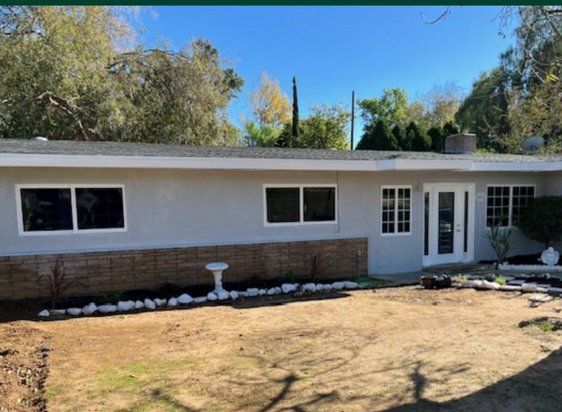
5011 Hedrick -Single family