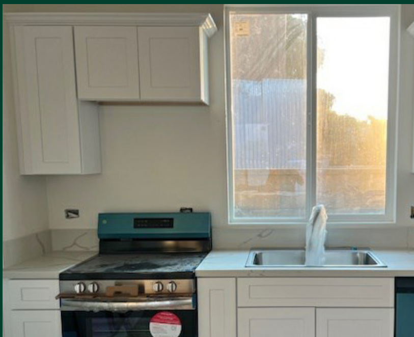
New Adu - Built 2024