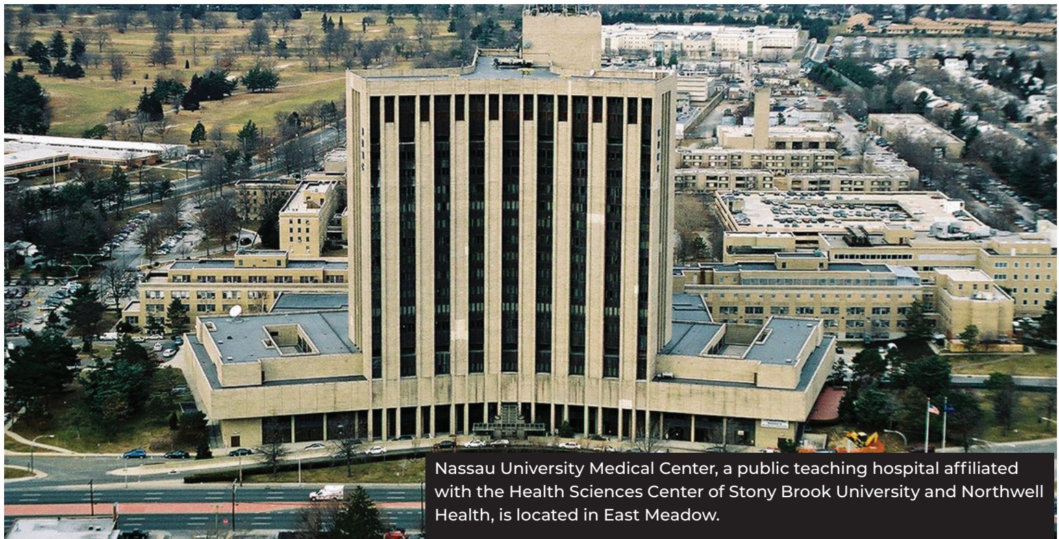
Nassau University Medical Center, a public teaching hospital affiliated with the Health Sciences Center of Stony Brook University and Northwell Health, is located in East Meadow.