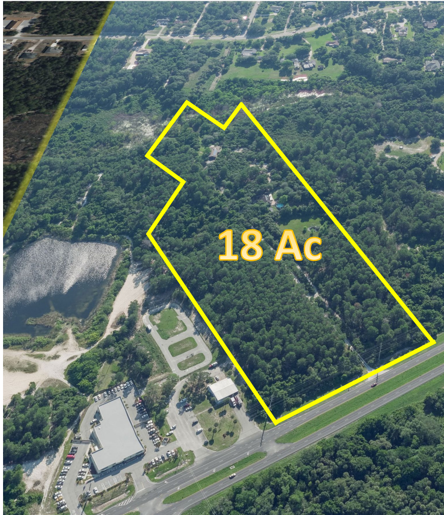
Facing North – Site Overview