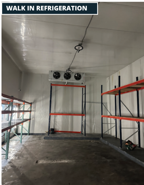
WALK IN REFRIGERATION