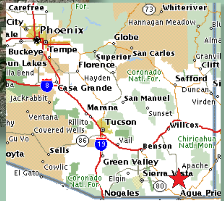
Sierra Vista/Fort Huachuca, Arizona