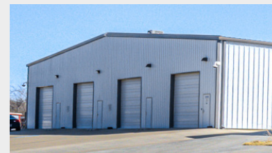
Illustration of potential loading doors (negotiable). Not photo of actual building