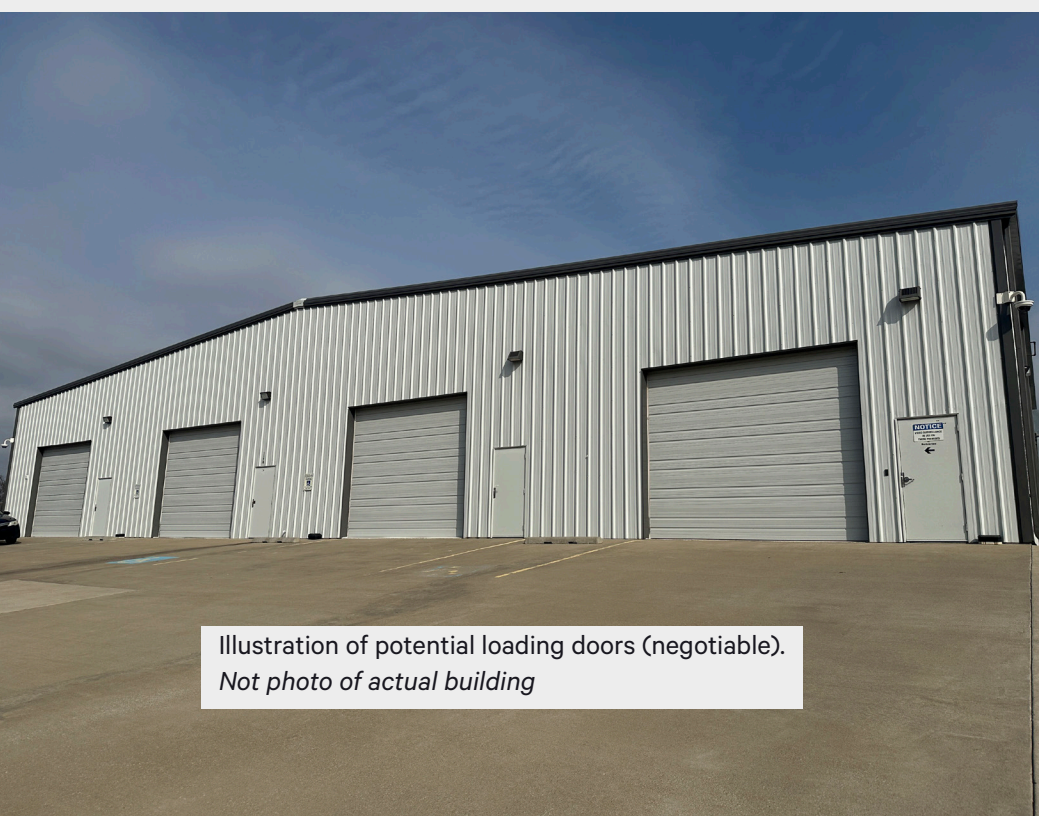
Illustration of potential loading doors (negotiable). Not photo of actual building