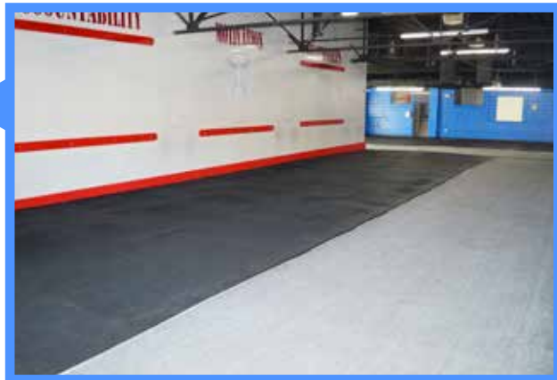
STE 5809 - Former fitness space