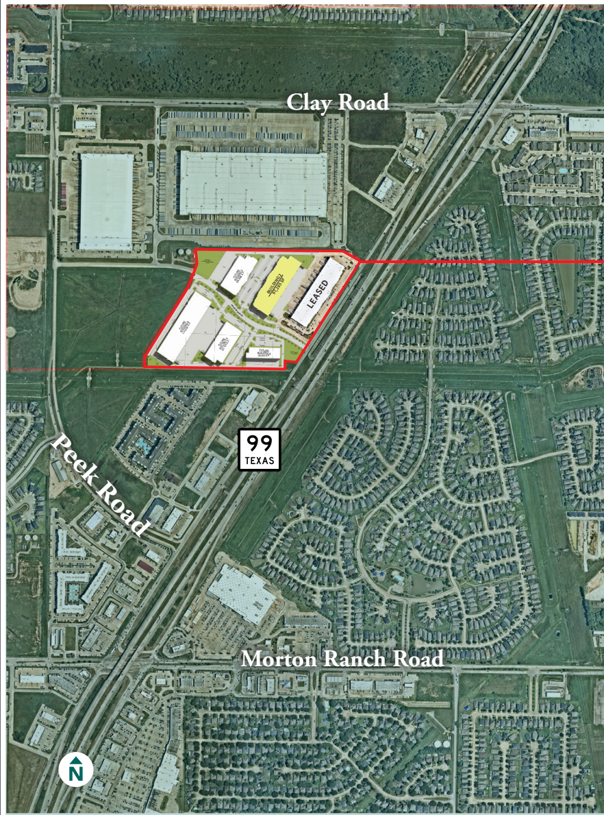
Overall Site Plan