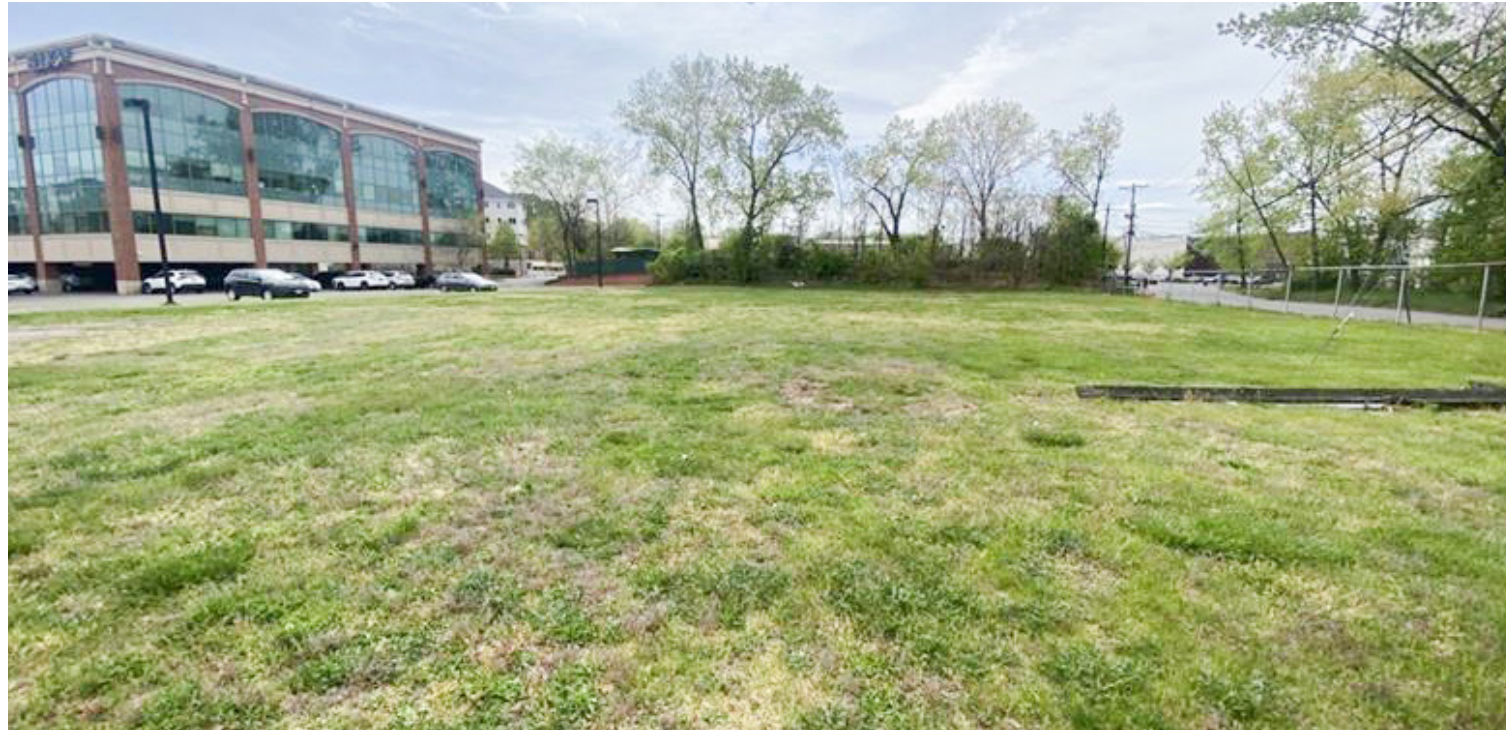
LAND - .7 ACRES