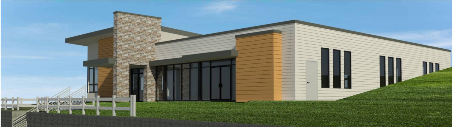
VIEW OF FRONT ENTRANCE FROM MAIN STREET