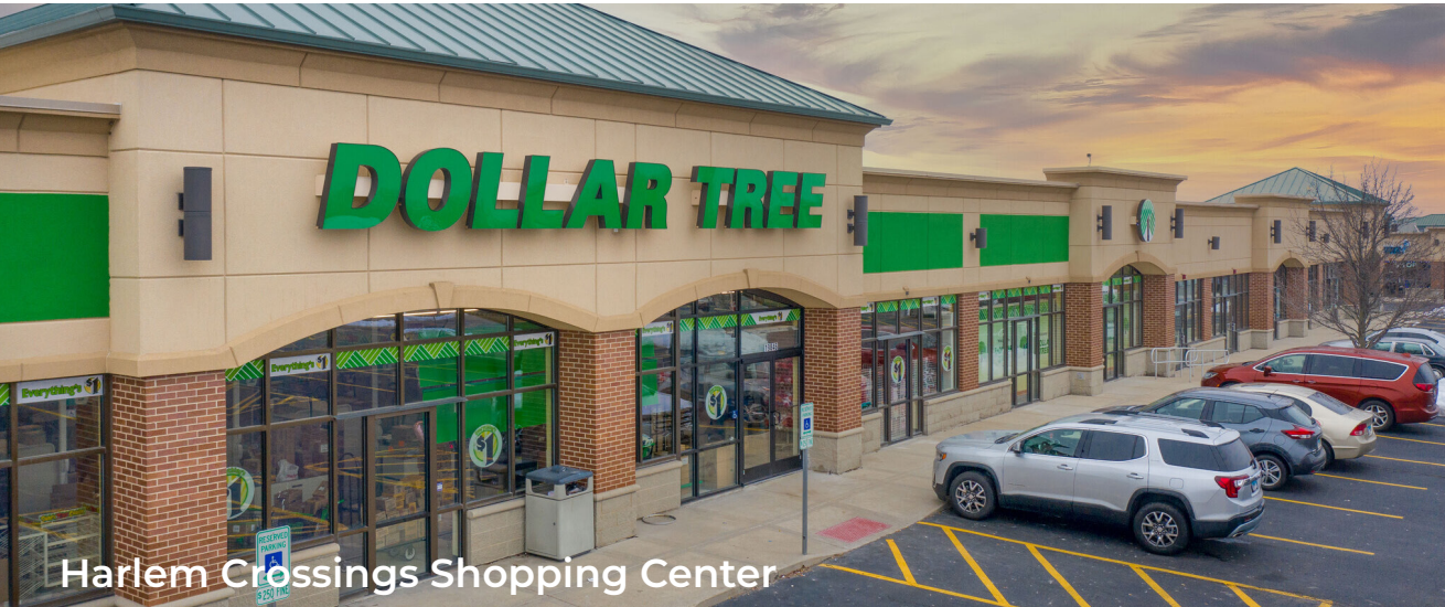
Harlem Crossings Shopping Center