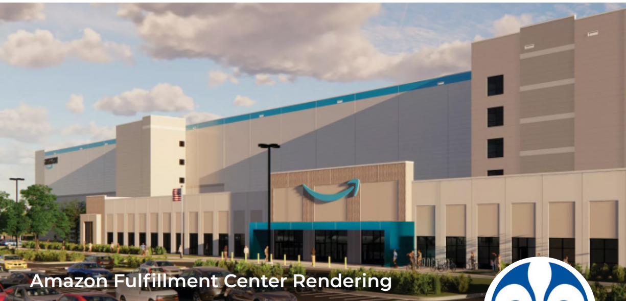
Amazon Fulfillment Center Rendering