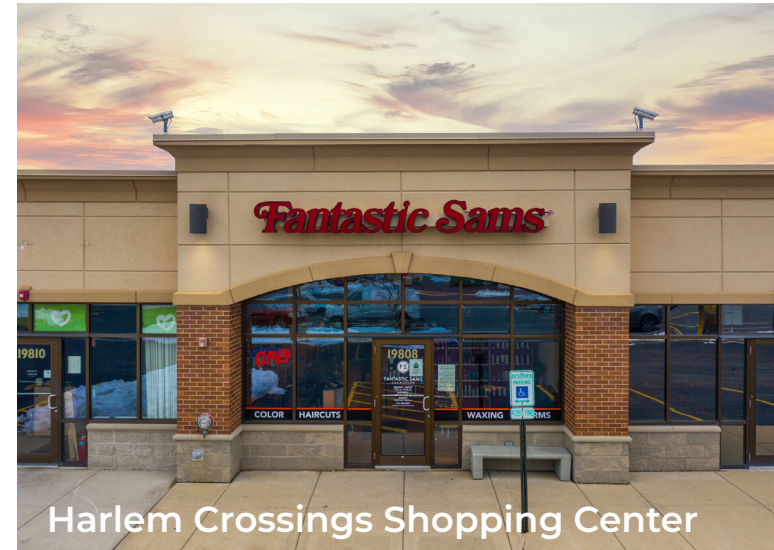
Harlem Crossings Shopping Center