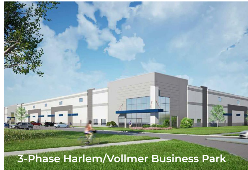
3-Phase Harlem/Vollmer Business Park