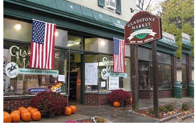
Close to Shops & Restaurants