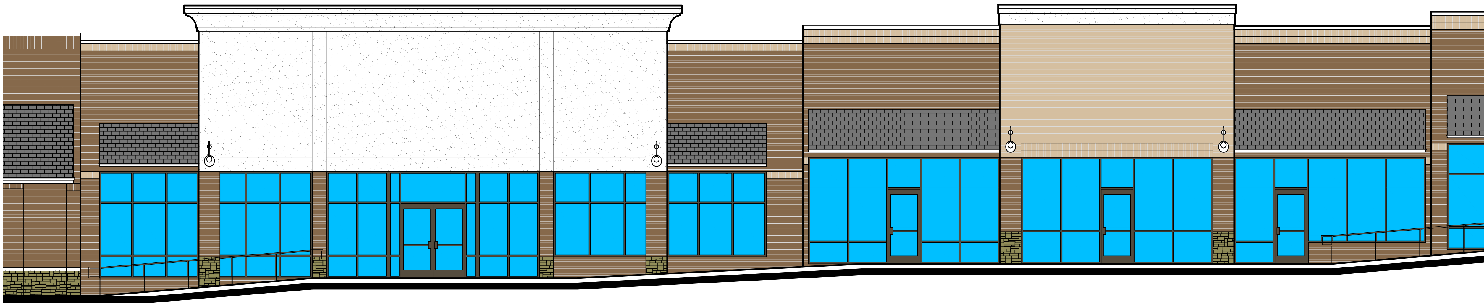
C1 ELEVATION A-1.02 SCALE: 3/16"=1'-0"